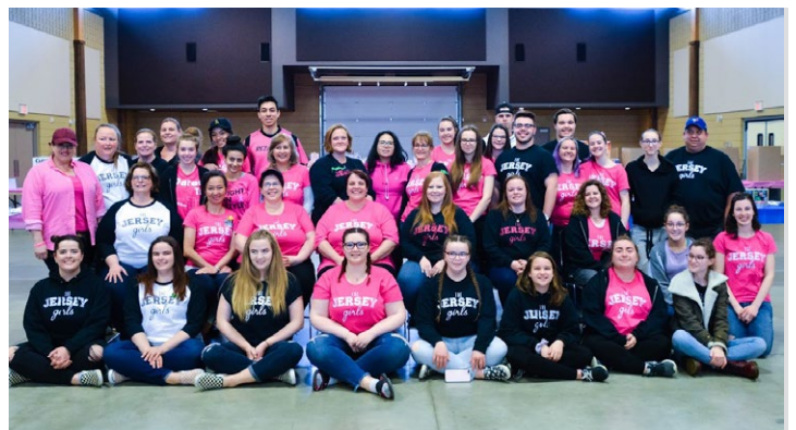
The Jersey Girls and supporters

After a few years of hiatus due to COVID-19, this past month, The Jersey Girls’ 9th Annual Spaghetti Dinner, including a silent auction, aimed to raise more than $12,000 with proceeds supporting Juravinski Hospital and Cancer Centre.