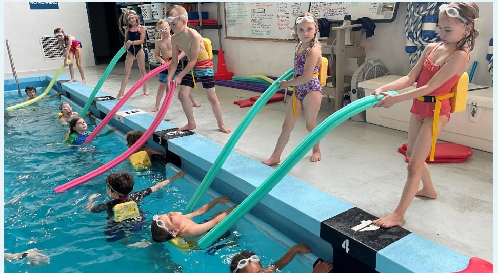
Photo above: How to be a first responder while looking out for our safety!

A major component of the program is teaching water-safety. We live in a community surrounded by water and dominated by water-related recreation. NCRD provides a safe environment where the students can learn to swim while being educated in water safety. Besides instilling swimming as a lifetime skill and healthy recreational activity, the skills they learn in the pool could save their life or the life of another. Well over 10,000 students have benefited from the program over the past 92 years. We can say with confidence that this program has undoubtedly saved many lives! ♦