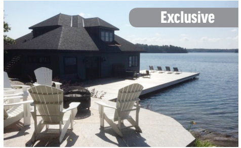
$6,765,000 – Lake Joseph Famed Sandfield / Minett Sunset Corridor