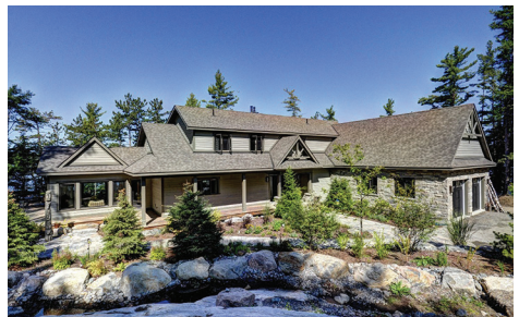
$3,995,000 – Lake Rosseau Coveted 4 Mile Point