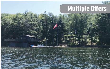
$4,250,000 – Little Lake Joe Sunsets and Privacy