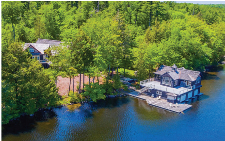
$5,750,000 – Lake Muskoka A most Comprehensive Estate