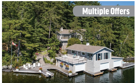
$4,795,000* – Lake Rosseau Idyllic Family SW Compound