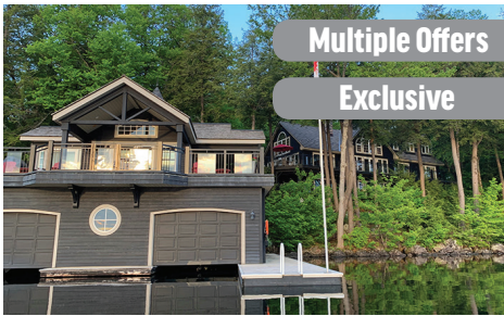
$5,100,000 – Lake Rosseau Ferndale Locale