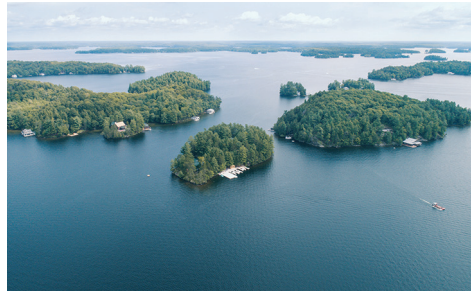
$5,495,000 – Lake Rosseau Olive Island Private Island Splendour