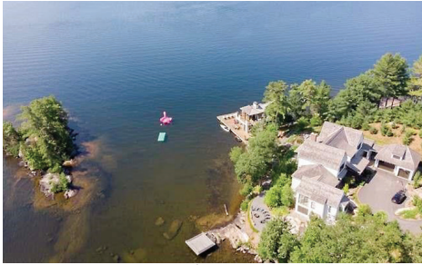
$16,995,000* – Lake Rosseau Exquisite Estate includes private "swim to" Island