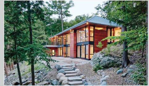
Lake Rosseau $6,575,000 – Port Sandfield Kingsett