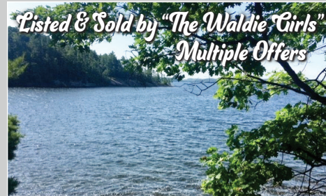
Lake Rosseau $1,495,000 – Tennessee Bay