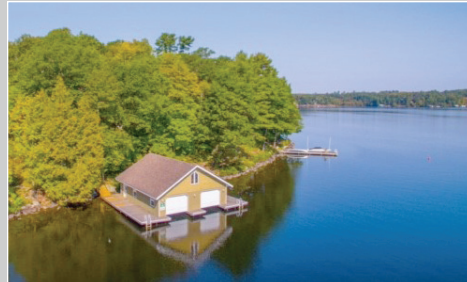
Lake Rosseau $1,699,000 – Maplehurst Magnificence