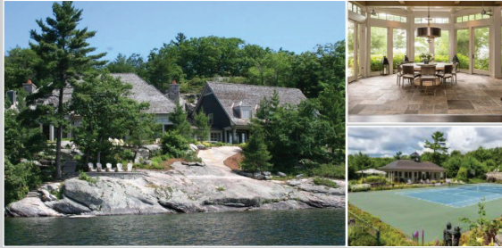
Lake Joseph $14,700,000 – Winterberry Wonderland