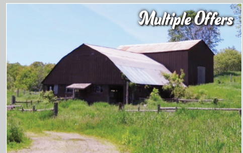
Lake Rosseau $649,000 – 30 Acre Farm "Rosseau View"