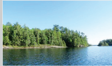
Lake Joseph $3,900,000 – Lookout Point