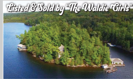
Lake Rosseau $6,950,000 Kelley Point