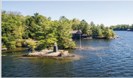
Lake Muskoka $5,495,000 – North Beaumaris