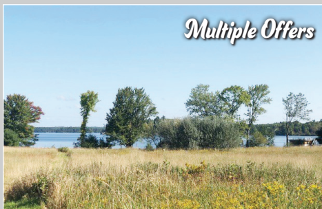
Lake Rosseau Arthurlie Bay – 1,095,000