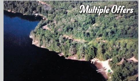
Lake Rosseau $1,300,000 Cameron Bay