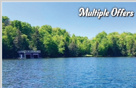
Lake Rosseau $929,000 – Port Sandfield/Minett Corridor