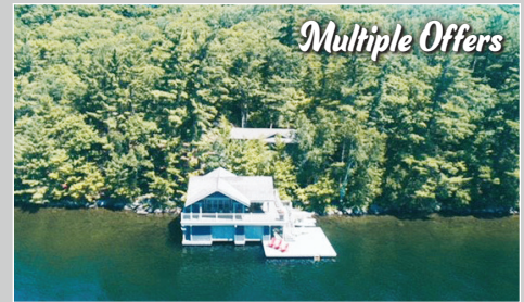
Lake Joseph $2,695,000 – Port Sandfield Sunsets