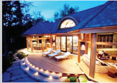
Lake Joseph $12,500,000 – Hemlock Point