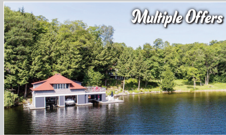
Lake Rosseau $5,295,000 – Sandy Bay Farm