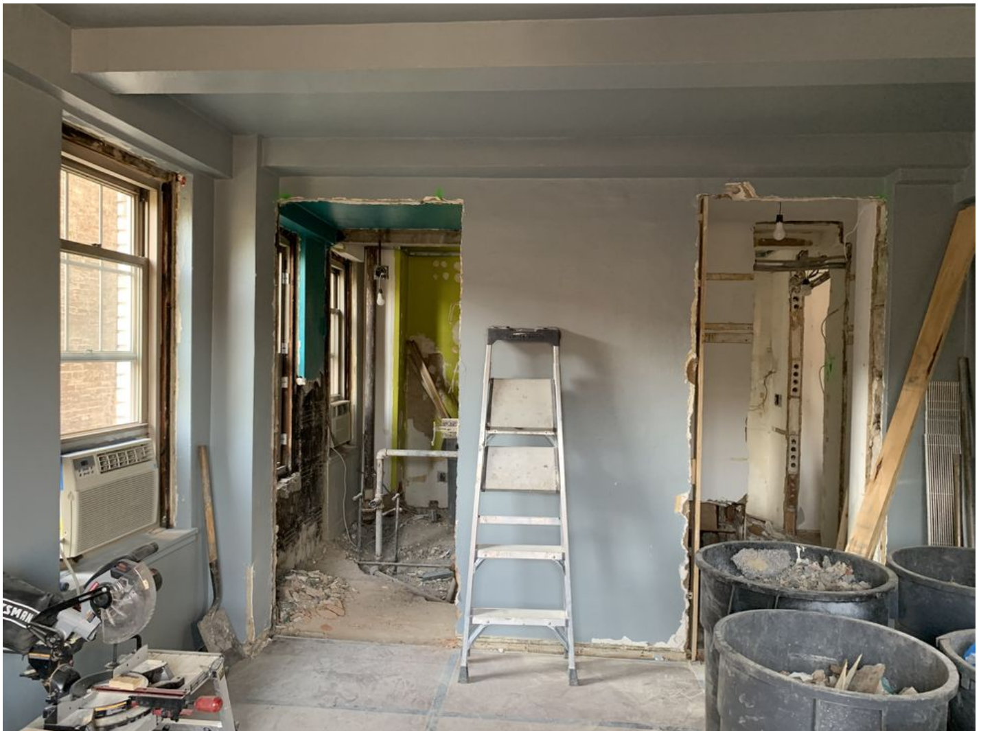
Before: Bedroom looking into bathroom

Rug: Reflection B by Makrosha. Wallcovering: Cozy Nestle by David Rockwell for Maya Romanoff