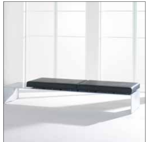
Model #23801 Elevation bench