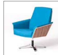
Model # 10051

3,360 3,525 3,500 4,230 4,370 4,445 3,775 4,190 4,645 5,090