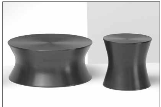
Model #31903 & Model #31902 with black finish

Spin tables and stools are available in a clear or black, anodized finish specify at time of order.