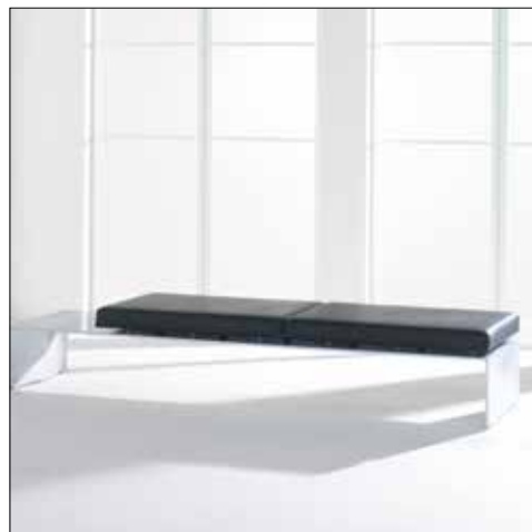
Model #23801 Elevation bench