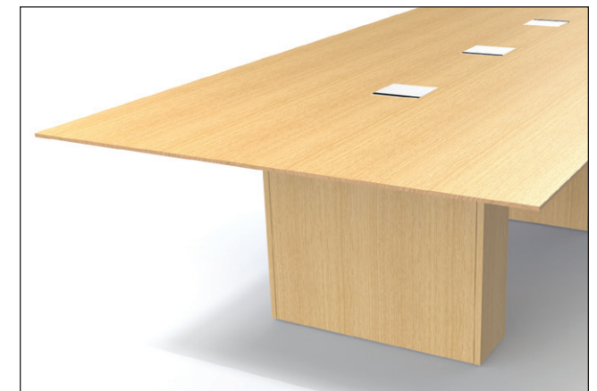
Access base with anodized aluminum trim

Access Base Vox® Conference Tables are available in standard sizes, from 72" x 36" up to 240" x 84". Square and Round tables from 42" to 96". Shapes available are Rectangle, Boat, Rectangle Wave, Racetrack, Super Ellipse, Vista Closed, Square, Square Wave and Round. Access Base comes in 6" or 8".