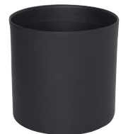
Waste Basket 201