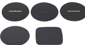
Round Coaster 202 Square Coaster 204 (Embossing and Gold & Silver Foil Stamping Available)