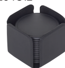
Round Coaster Container 204C12