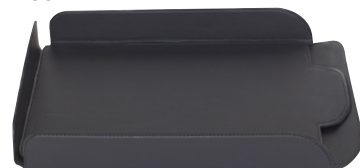
Leather Tray 181 with Cover 181C