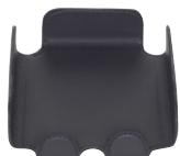
Memo Holder 185