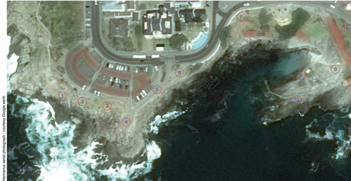
Hermanus aerial photograph

As is often the case when one is in the process of assembling an exhibition with its different participants and dynamics, a thread is the thing to trust - not unlike Paul Klee's walking line. Each work installed in this year's event signals a point of resonance with one or another, be it in the materiality of the work, the referencing of ecology or aspects of the Old Harbour. This heritage site has been included in Sculpture on the Cliffs for the first time, by kind permission of the Old Harbour Trust.