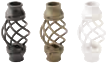
Decorative Baluster Baskets