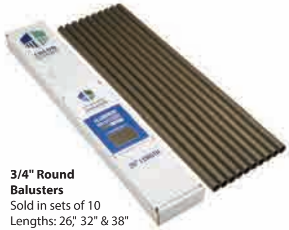
3/4" Round Balusters Sold in sets of 10 Lengths: 26", 32" & 38"

Box includes factory-routed aluminum reinforced rails, rail brackets, hardware, bottom support block and installation instructions. Balusters, post, post mounting brackets, post caps and decorative collars are sold separately.