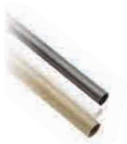
Baluster Colors bronze, white & black