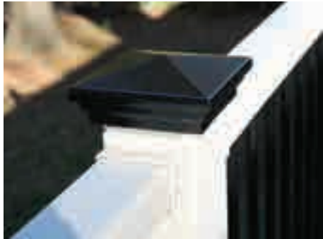
Designer Caps & Collars