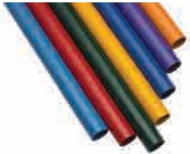
Super Fan Balusters