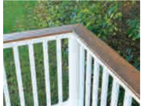
Key West Drink Rail Bracket System