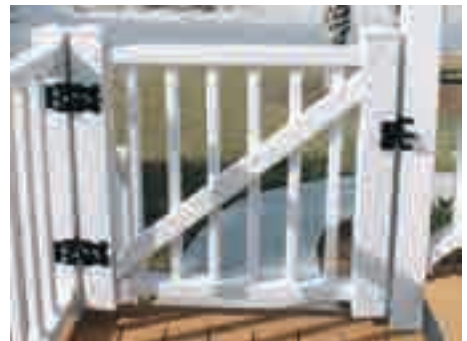
Gate with Powder-Coated Stainless-Steel Hardware