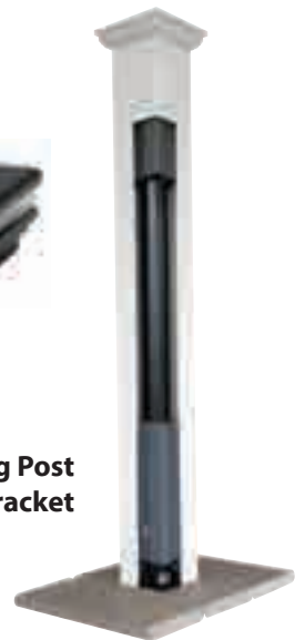
Leveling Post Bracket