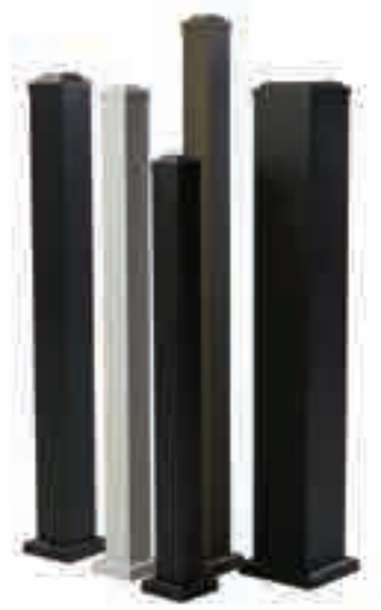
4 x 4 & 6 x 6 Blank Post Sleeves