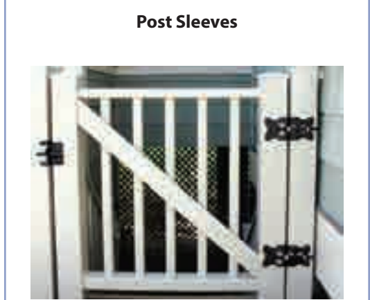
Gate with Powder-Coated Stainless-Steel Hardware