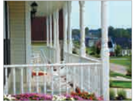
Colonnade Porch Post