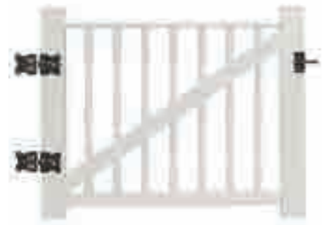
Gate with Powder-Coated Stainless-Steel Hardware