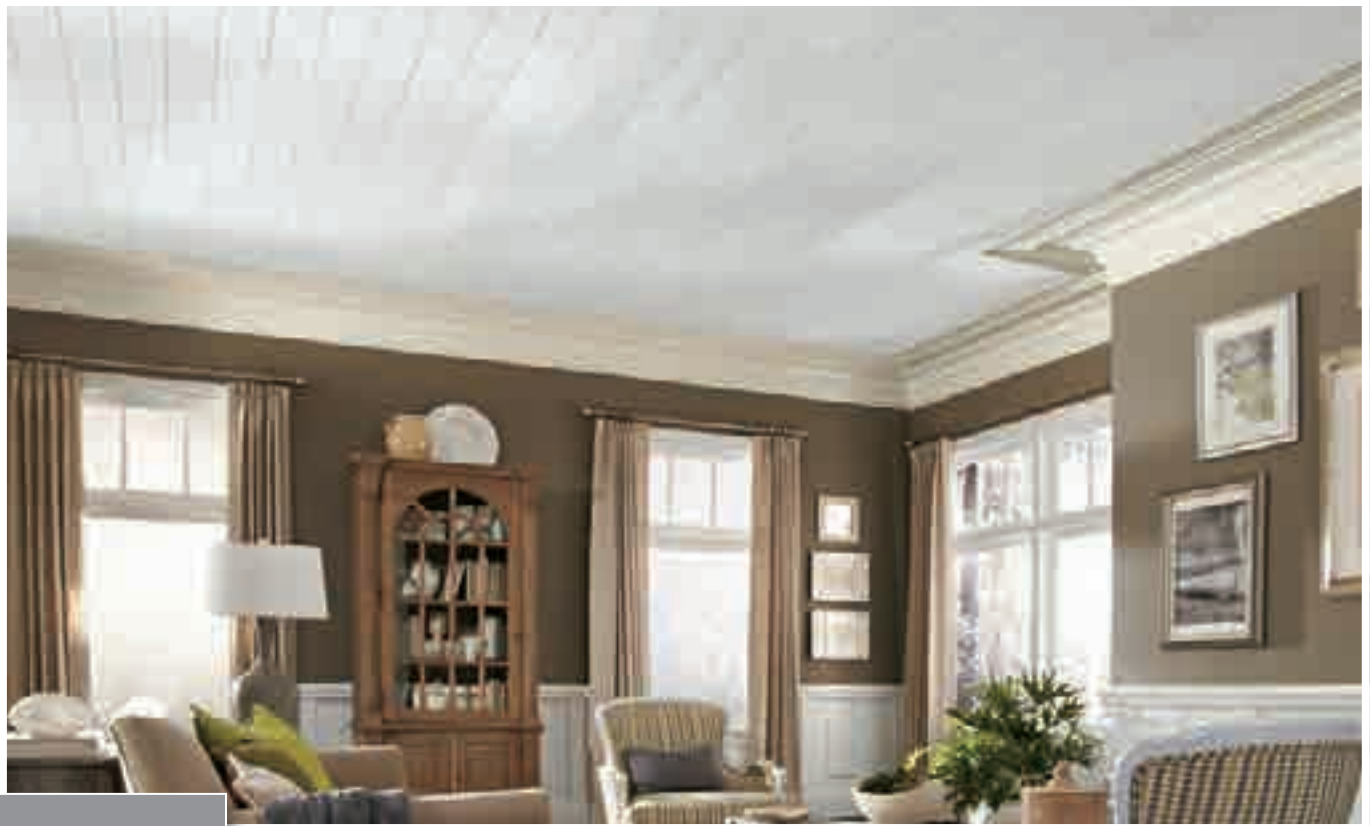
LIVING ROOM / FAMILY ROOM