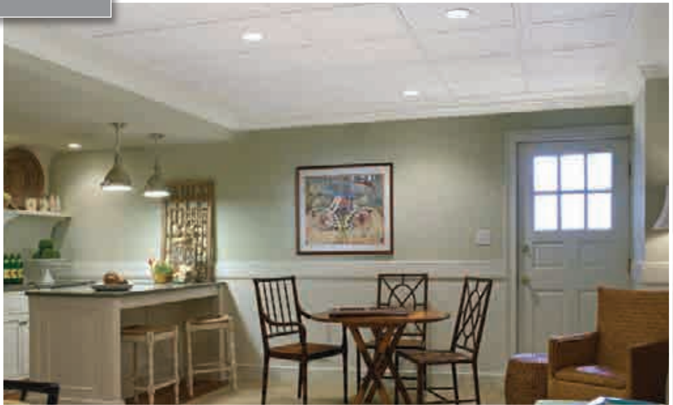
1205 SINGLE RAISED PANEL