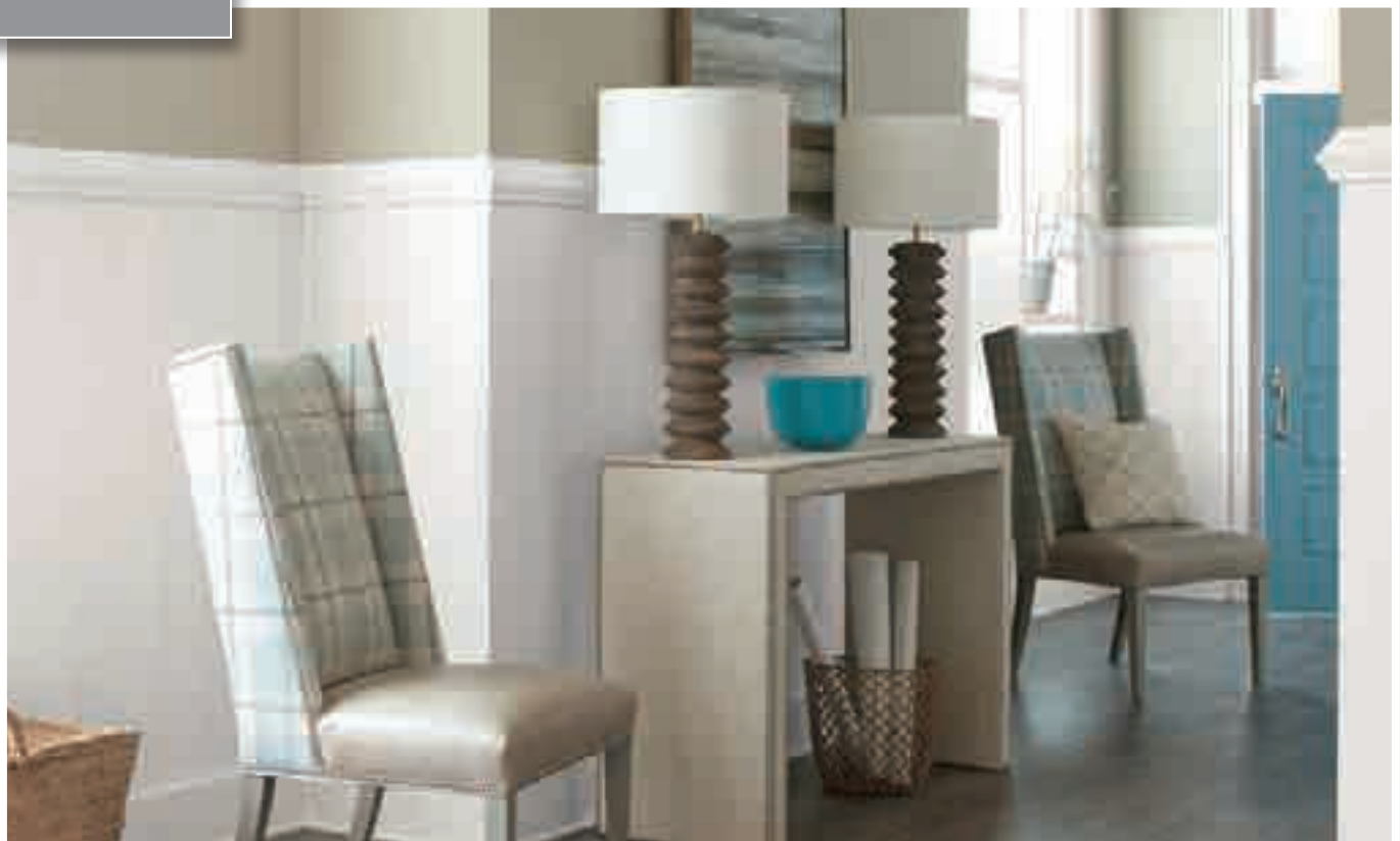
1138 WOODHAVEN™ WOVEN WHITE