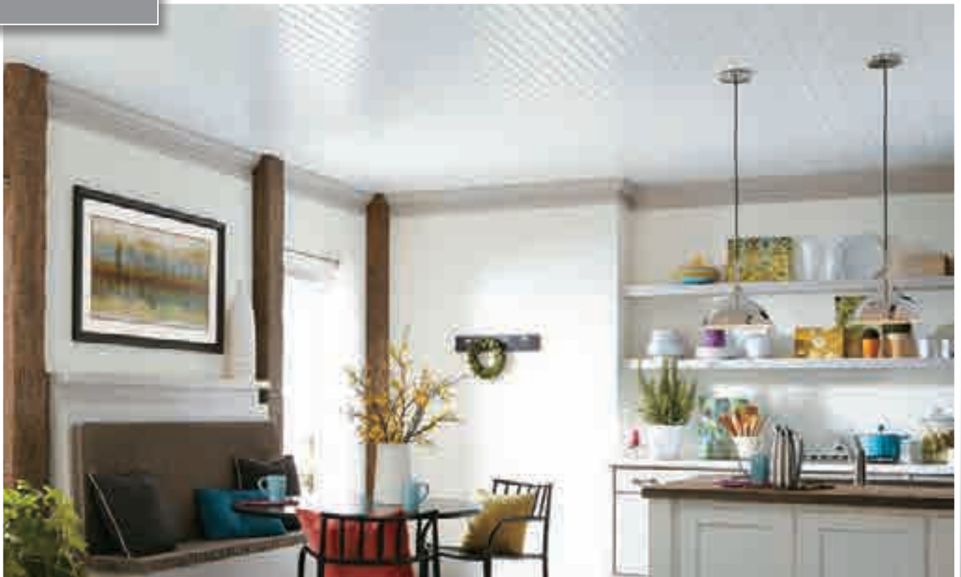
1149 WOODHAVEN™ BEADBOARD