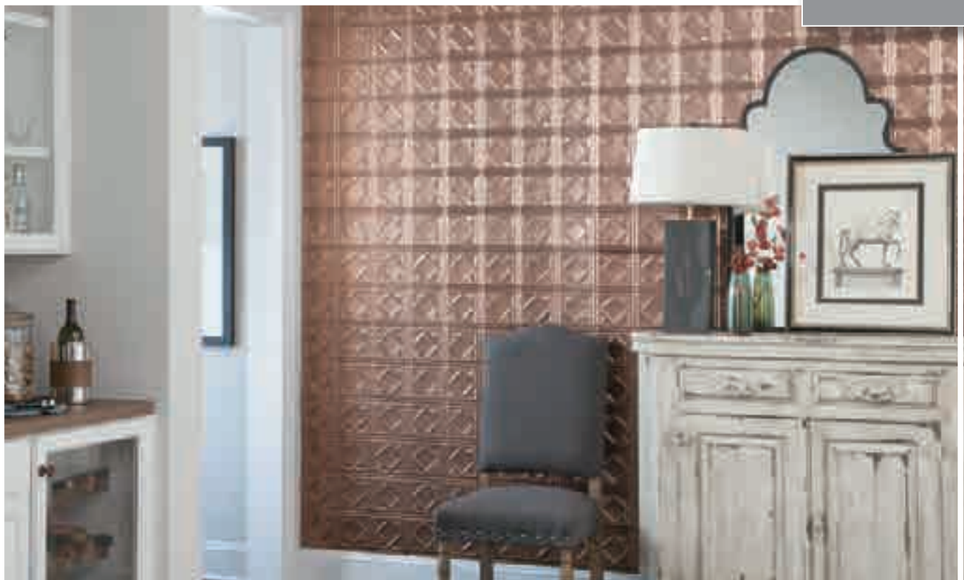
5424207NCP METALLAIRE™ FANS (WALL—COPPER)