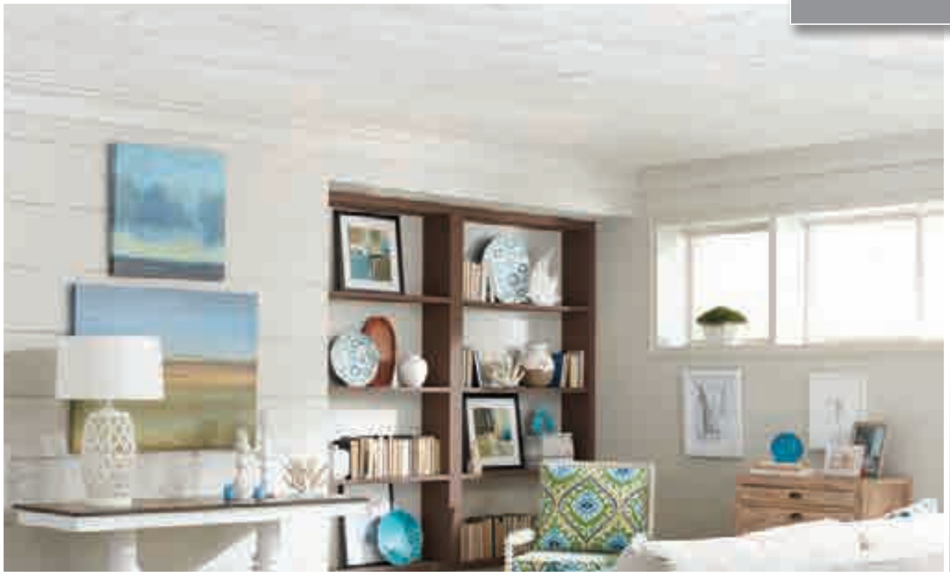
480 COUNTRY CLASSIC™ PLANK