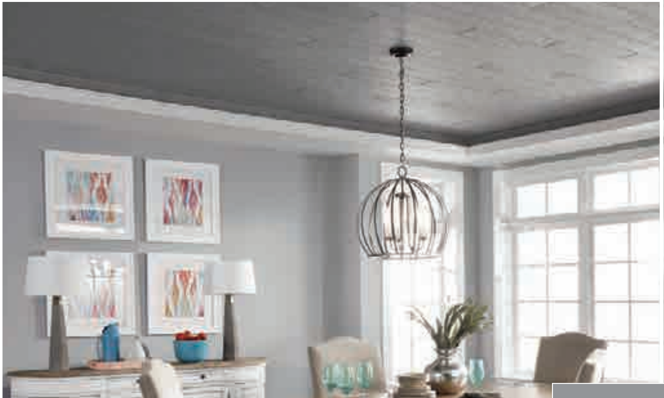
1139 WOODHAVEN™ WOVEN CHARCOAL GRAY