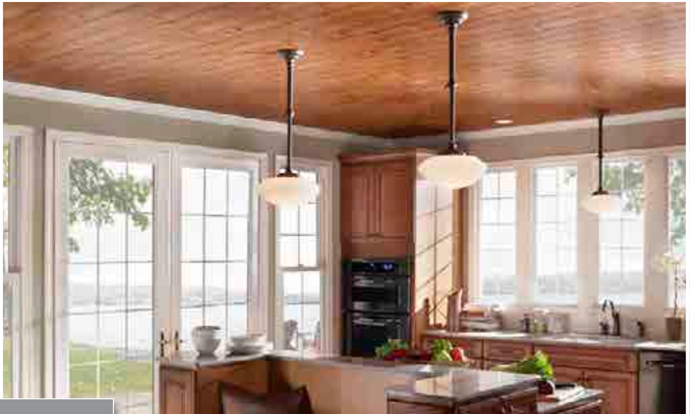
KITCHEN / DINING