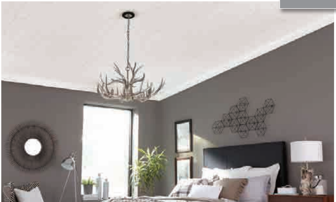
1138 WOODHAVEN™ WOVEN WHITE