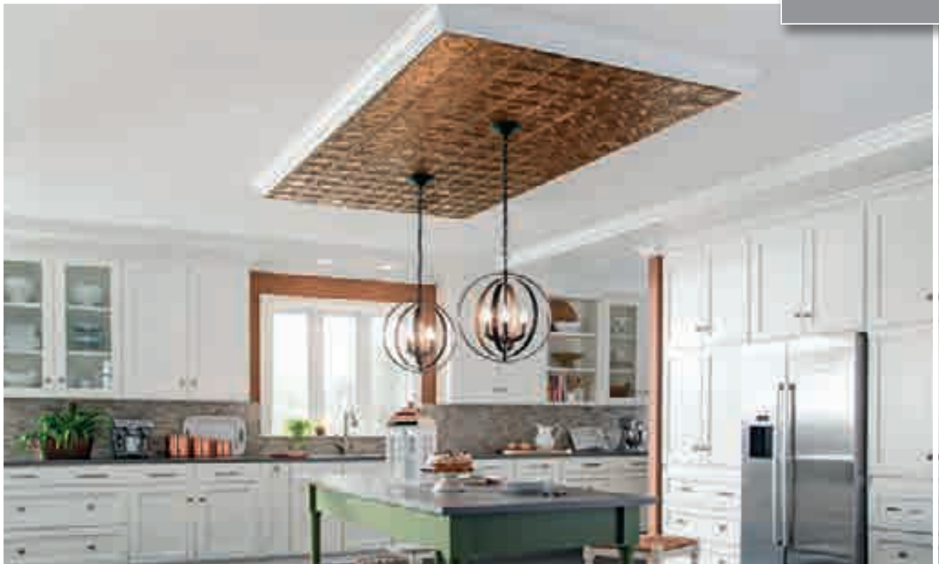
5424207CP METALLAIRE™ FANS (COPPER)