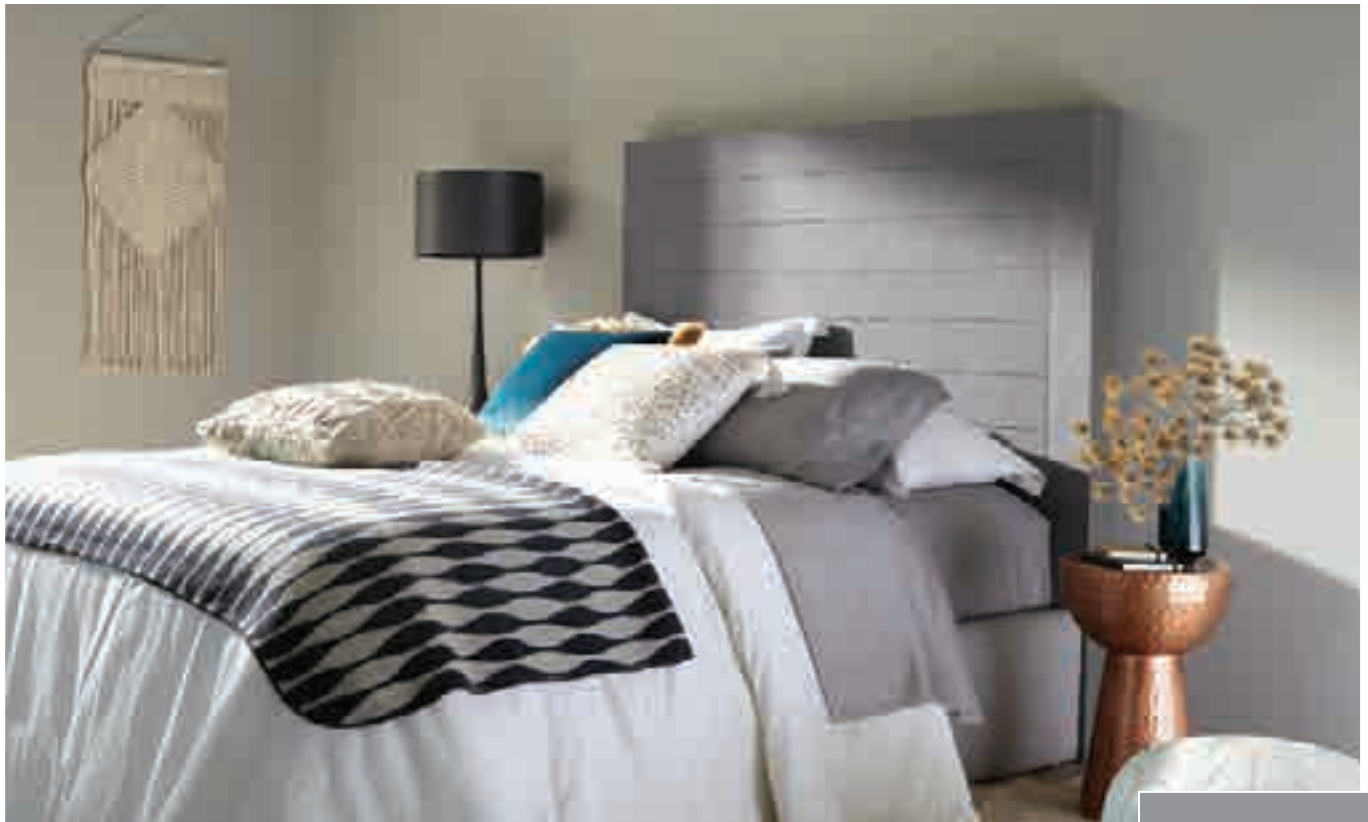
1139 WOODHAVEN™ WOVEN CHARCOAL GRAY (HEADBOARD)