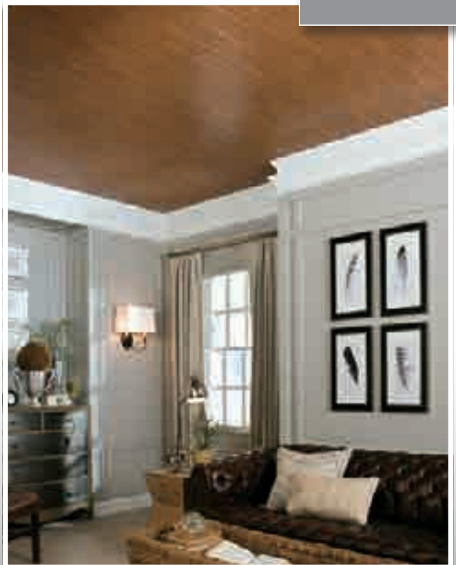
1260 WOODHAVEN™ KNOTTY PINE