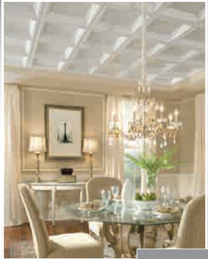
1280BXA EASY ELEGANCE™ DEEP COFFER WHITE