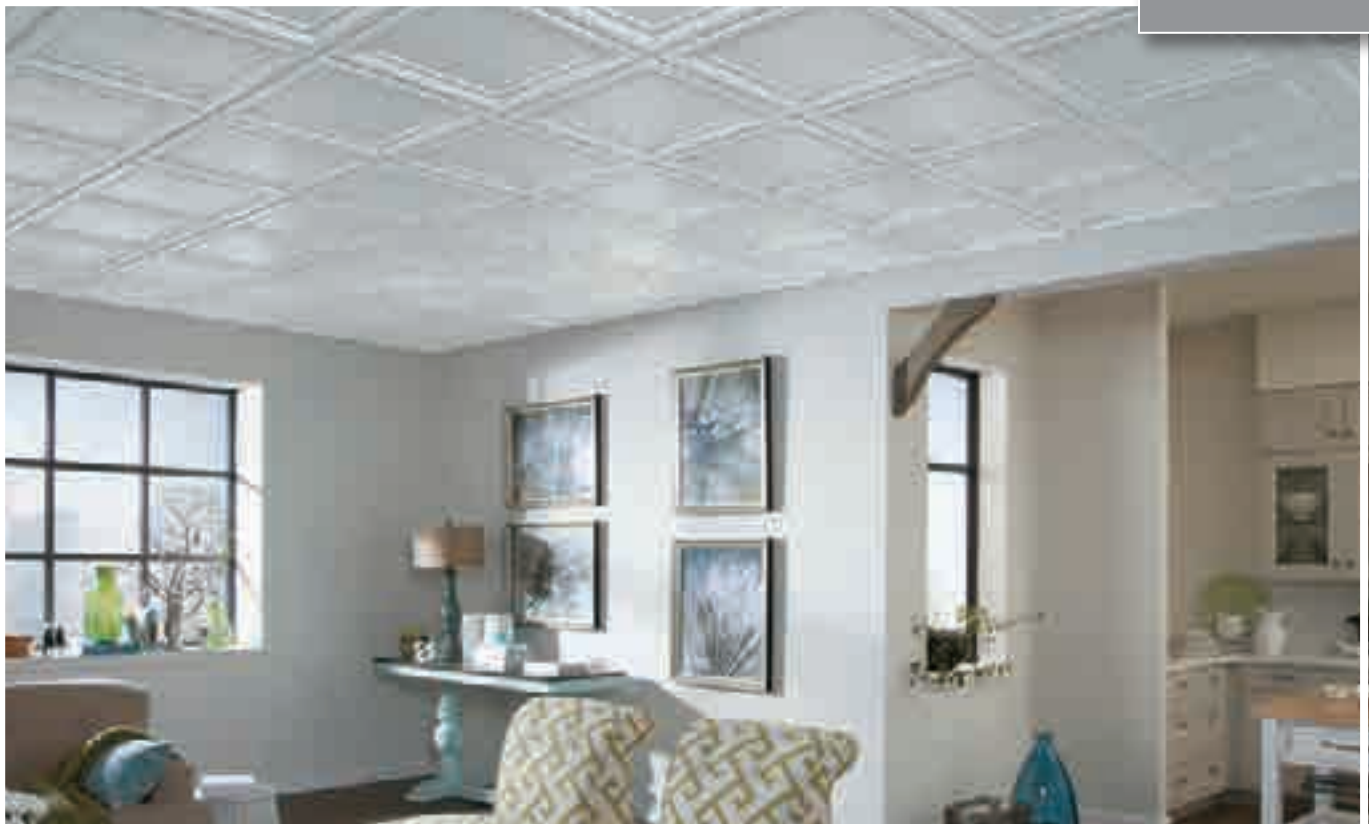
1282BXA EASY ELEGANCE™ SHALLOW COFFER WHITE