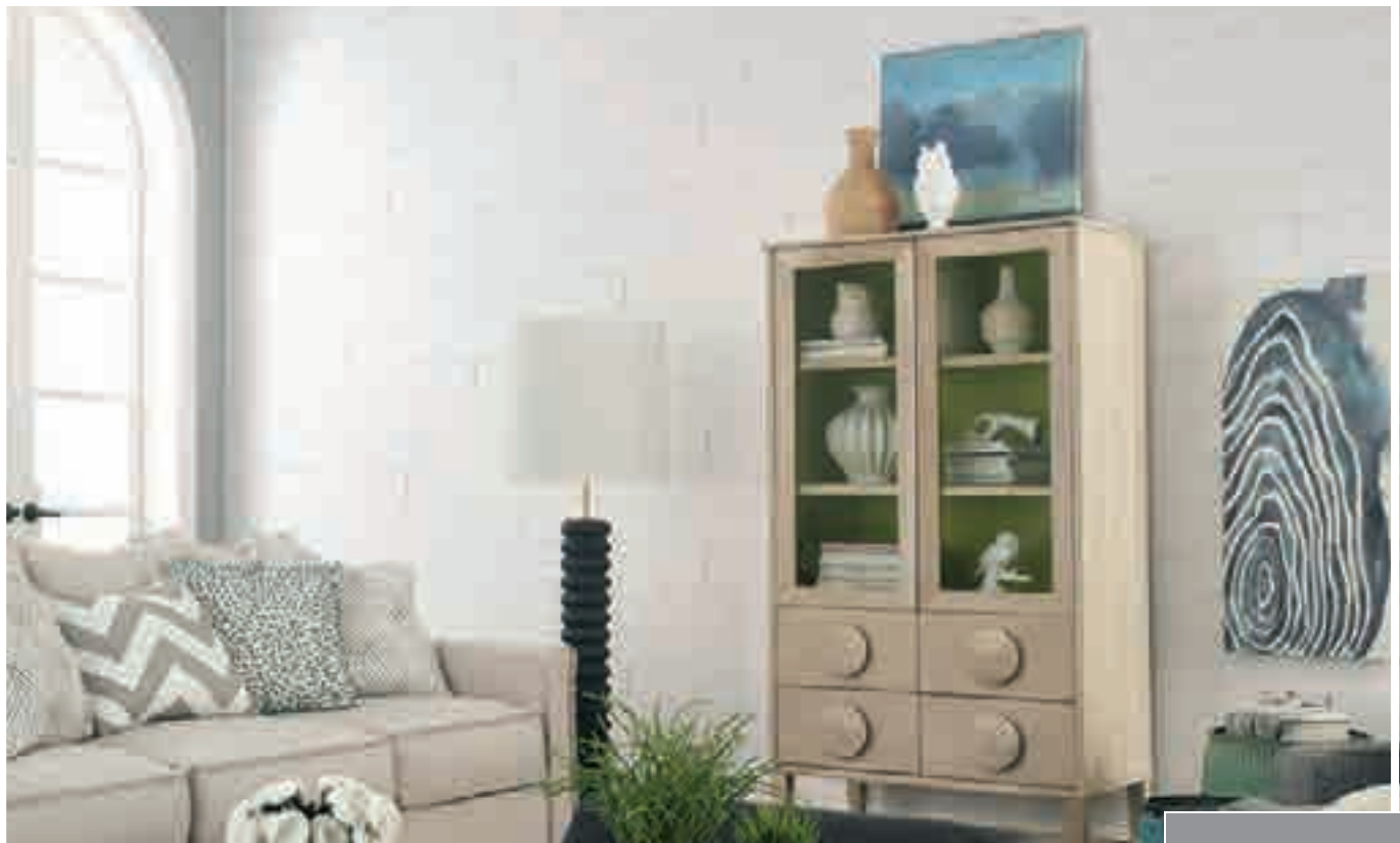
1140 WOODHAVEN™ CLASSIC WHITE (NEW FOR WALLS)