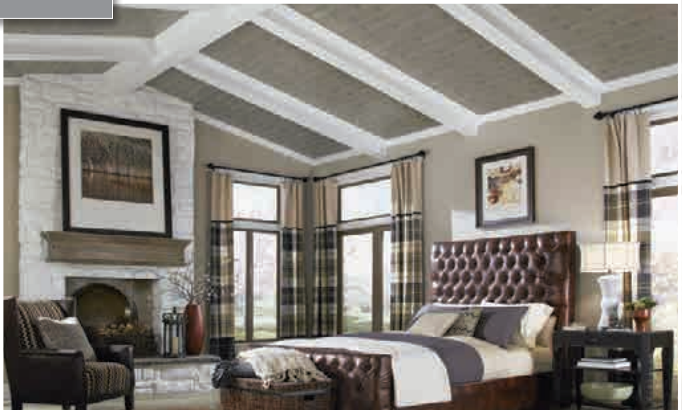
1273 WOODHAVEN™ WEATHERED