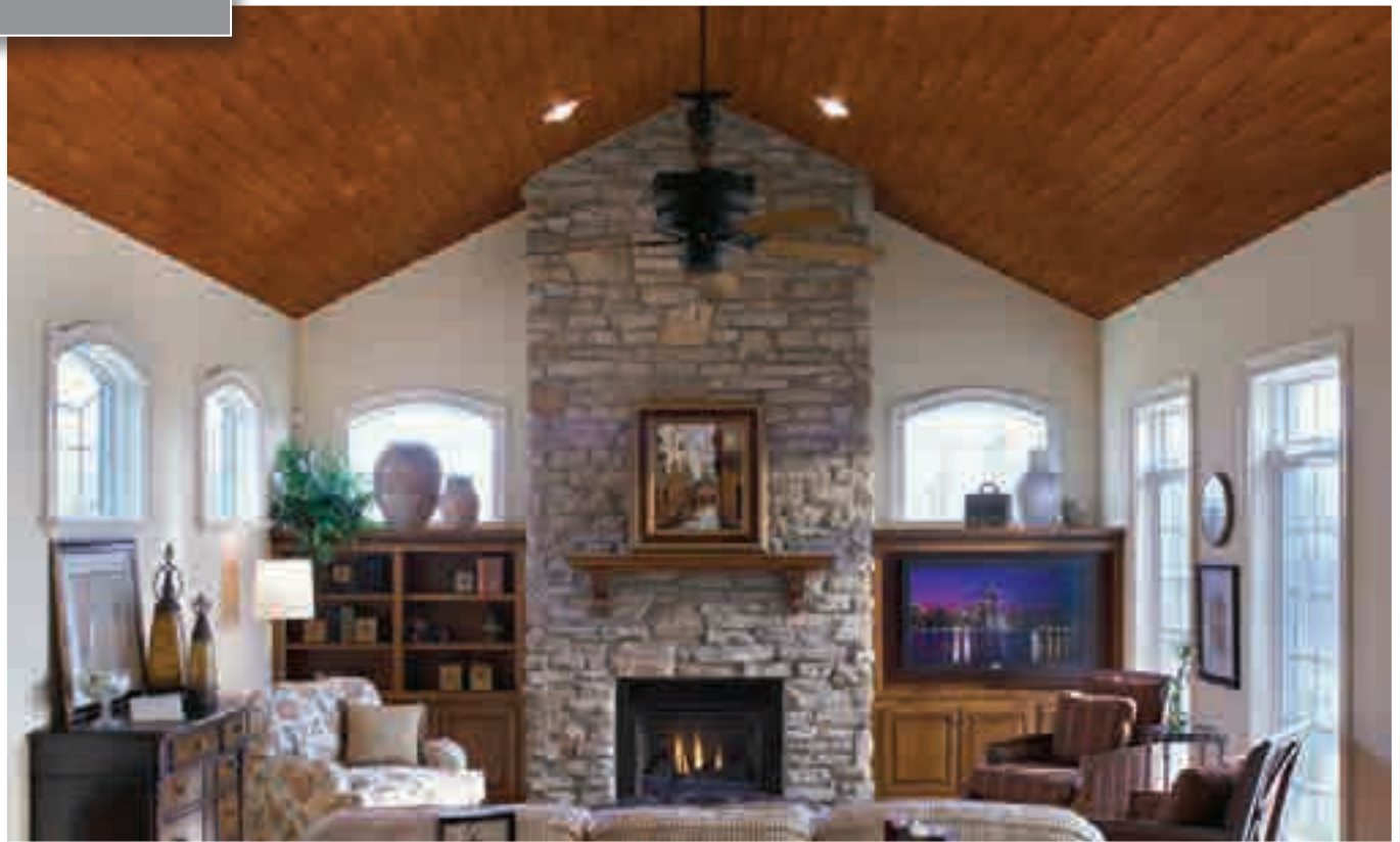
1264 WOODHAVEN™ RUSTIC PINE