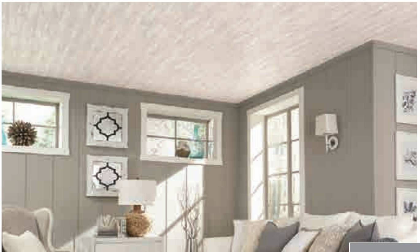
1275 WOODHAVEN™ COASTAL WHITE