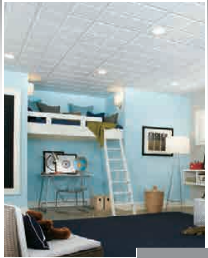
1201 RAISED PANEL™