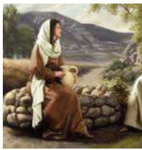
the woman at the well