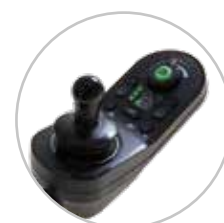
REM215/216 Drive, Power Positioning and Lights Remotes