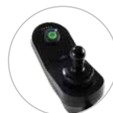
REM110 Drive Only Remote