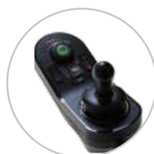
REM210/211 Drive and Power Positioning Remotes