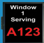
Pharmacy Services Portal