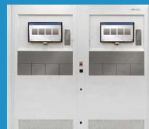
Storage and Retrieval System