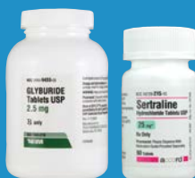
ScriptPro Inventory Management