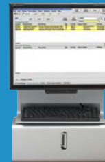
SP Datapoint with SP Printer

Electronic Signature — Records signatures for prescription pickups, HIPAA forms, and program participation elections. It is configurable for custom forms and notices.