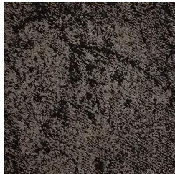
Danby L: 27.24 • Y: 5.18