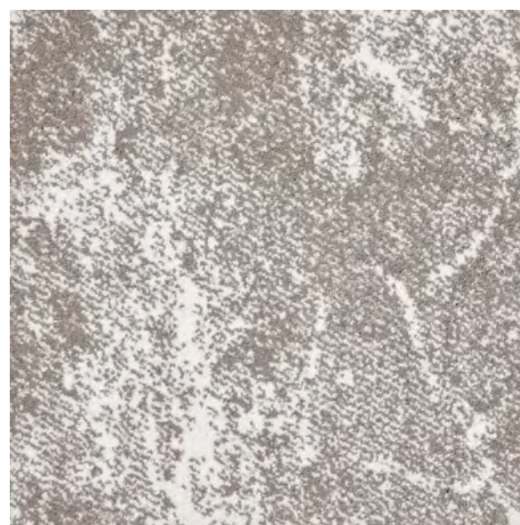
Alanya L: 69.34 • Y: 39.82