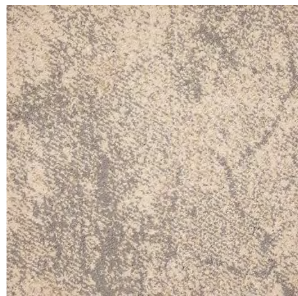
Agora L: 55.49 • Y: 23.41