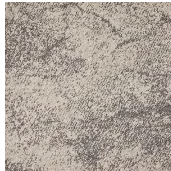
Penetelic L: 43.33 • Y: 13.38