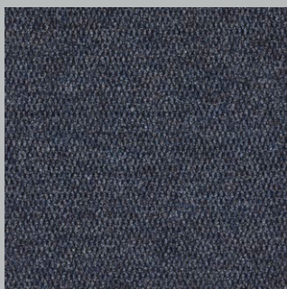
Coral L = 23.61 Y = 3.98