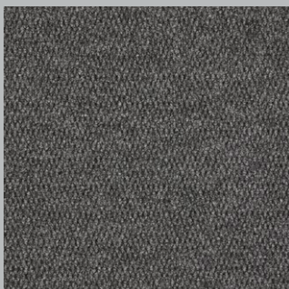
Rock L = 29.04 Y = 5.85