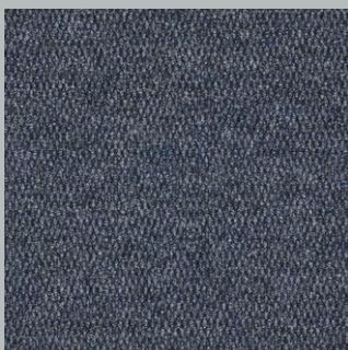
Blue Hull L = 26.70 Y = 4.99