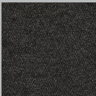
Kelp L = 15.56 Y = 2.01