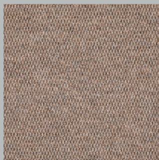
Crushed Shell L = 44.69 Y = 14.32