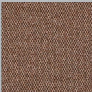
Wet Sand L = 33.38 Y = 7.72