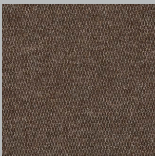
Galleon L = 26.66 Y = 4.97