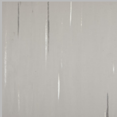
Solid Steel | 2 & 2.5mm