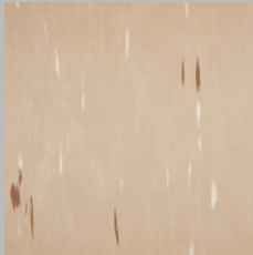
Brute Force | 2 & 2.5mm