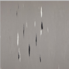
Sand Storm | 2mm