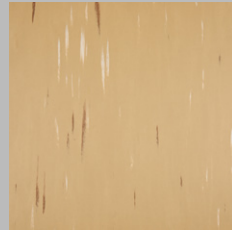
Cast Iron | 2mm