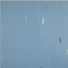
Burly Blue | 2mm