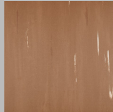
Ox Brawn | 2 & 2.5mm