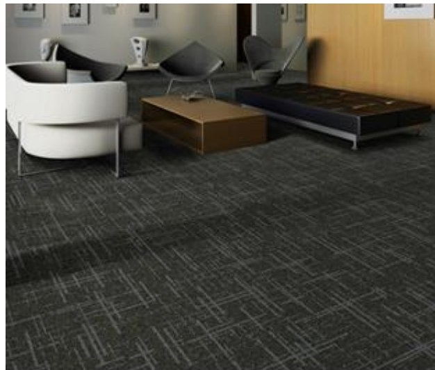
Figure 1 SDX Tufted Miraclebac Carpet