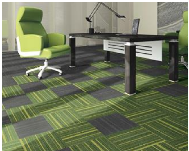
Figure 1 SDX Tufted Bitumen Backed Carpet