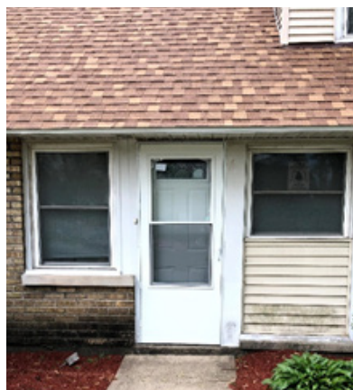
New Door Before & After