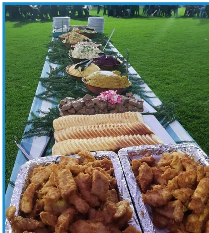
Island Fish Fry

Accommodation: Paradise Resort (Breakfast & Dinner)