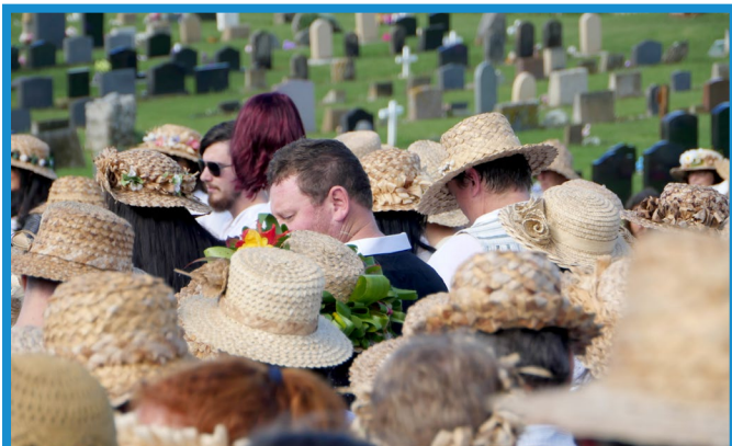
Learn about the Bounty mutiny

After lunch, you will set off on the Convict Kingston Tour . Learn about World Heritage Listed Kingston, the first settlers, and the Polynesians who came 900 years ago. Learn about our First and Second settlements, and the facts and legends associated with each. Learn how Norfolk became home to the descendants of the infamous Bounty mutiny, and walk through the historic cemetery.