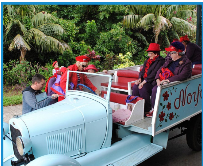
Visit Pitcairn Settlers Village (Optional activity at an additional cost)