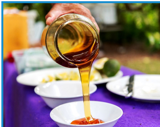
Farm and Industry Tour (Optional activity at an additional cost)