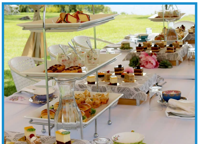
High Tea at Forrester Court

Today's lunch is a High Tea at Forrester Court . Indulge in a seasonal assortment of 6 savoury foods and 4 tantalising sweets, served on traditional platters. Menu includes a glass of sparkling wine on arrival, a pot of plunger coffee or T2 tea of your choice, we finish with sampling of local liqueurs. High Tea is served on the magnificent cliff top lawns overlooking Cascade Bay.