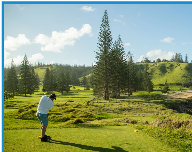
Play a round of golf at Norfolk Island Golf Club (Optional activity at an additional cost)

It's time to say farewell to Norfolk Island. Enjoy your last breakfast on the island, then take your transfer to the airport for your Qantas flight back to Melbourne (via Sydney).