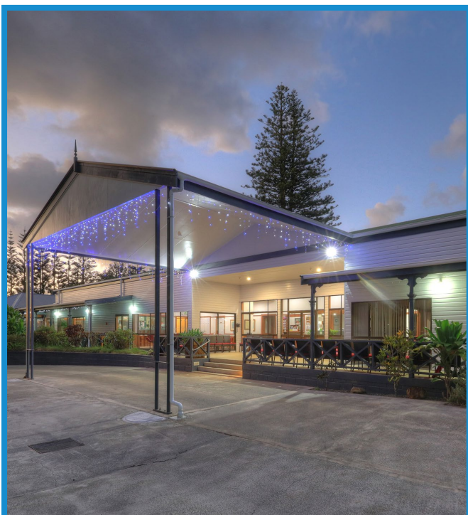
Paradise Hotel & Resort