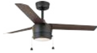
Matte Black /Dark Wood