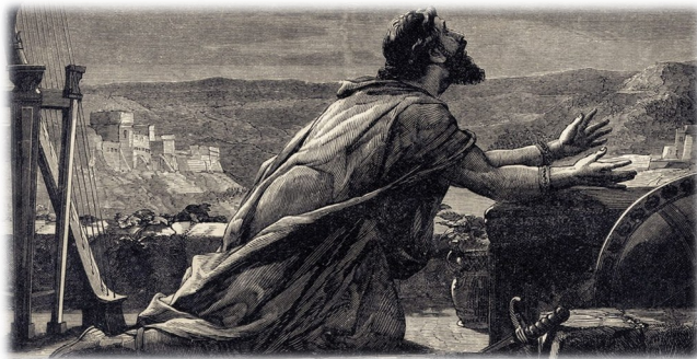
King David offering up prayer

This is New Hope Christian Fellowship. We're a non-denominational body of believers Who revere Jesus, and His Word. Our desire is to bless Him and provide a loving Church where His Spirit can transform us into disciples.