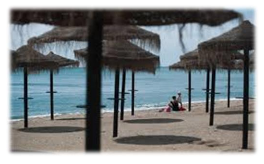
Welcome back to our summer visitors!

OOOOOPS, are you sure you came to the right place?