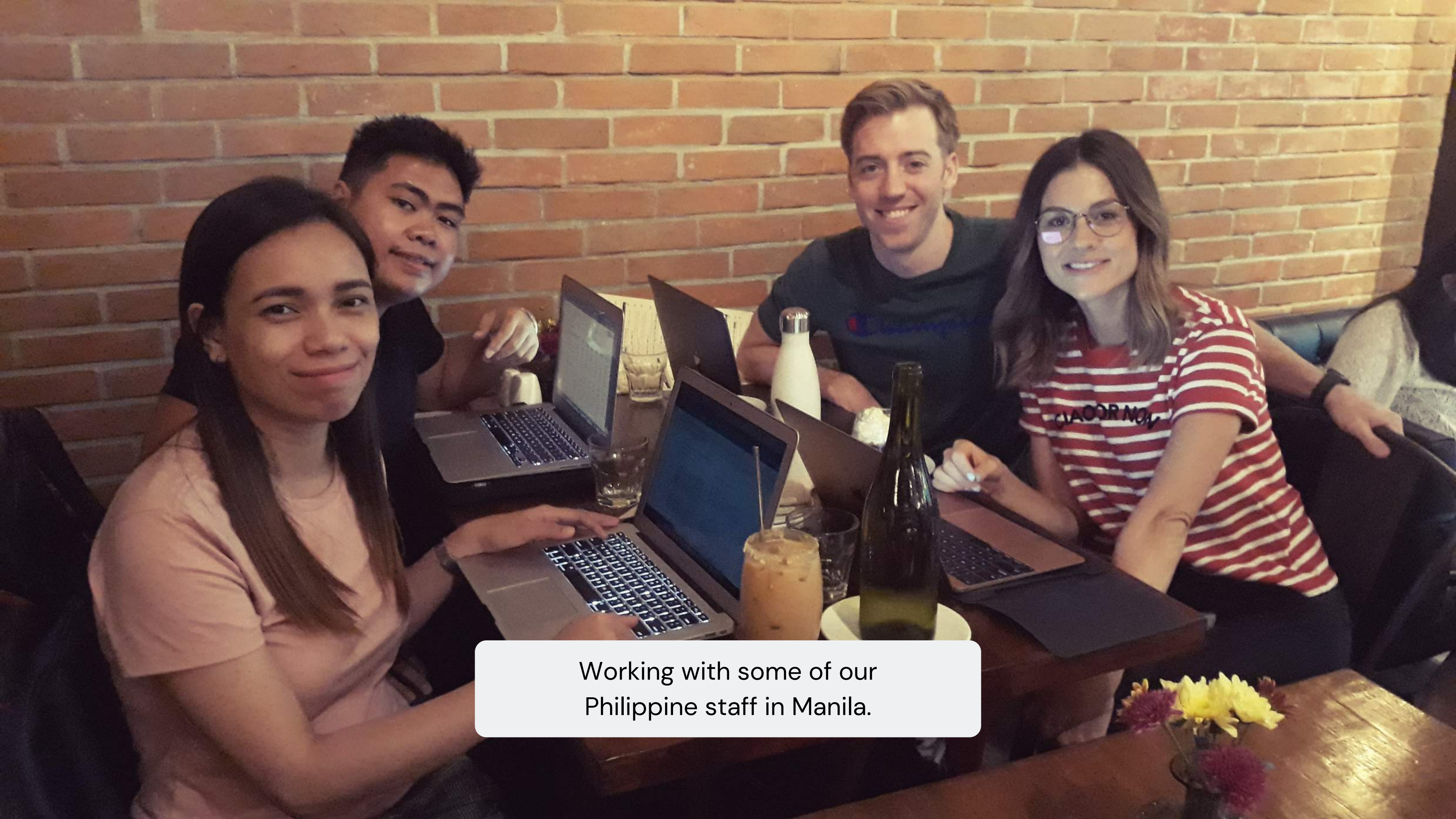
Working with some of our Philippine staff in Manila.