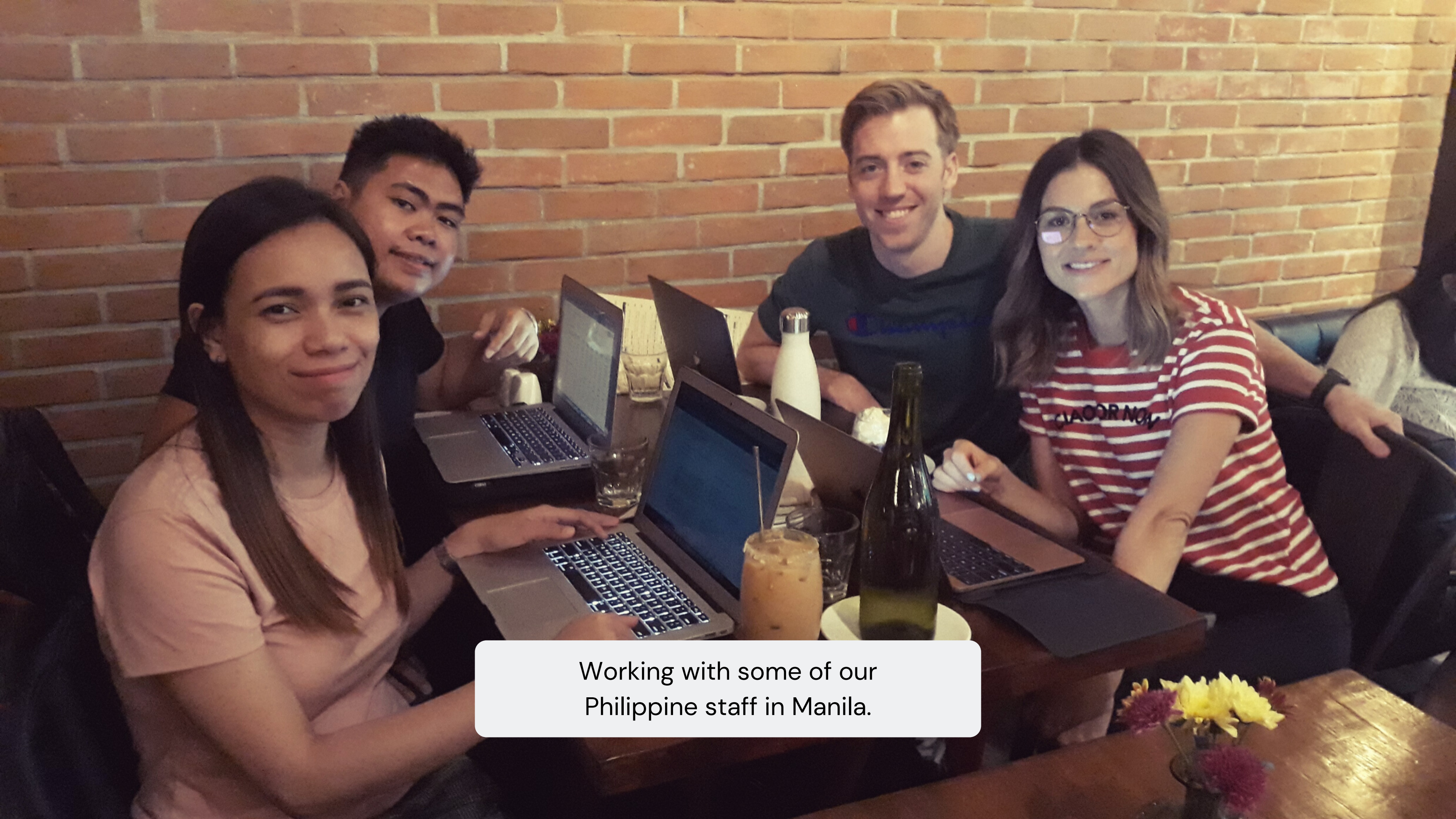
Working with some of our Philippine staff in Manila.