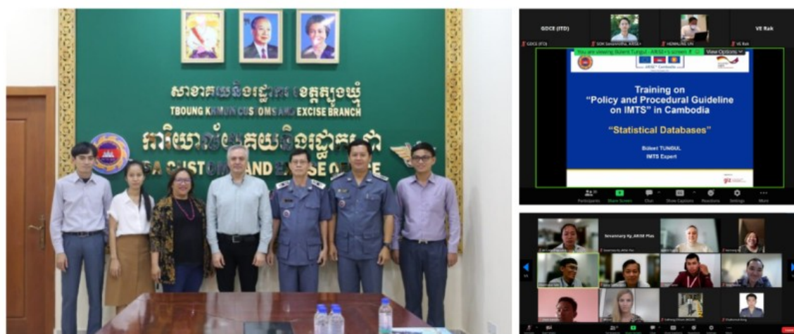
Expert mission and trainings on IMTS for the GDCE officials

ARISE Plus Cambodia continues to support the capacity development of the GDCE on the International Merchandise Trade Statistics (IMTS) in Cambodia.