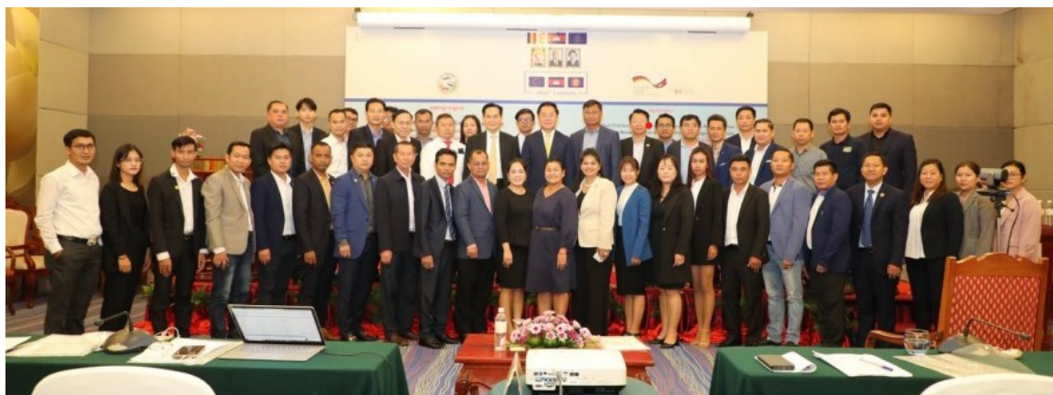
Group photo of all participants during the workshop

ARISE Plus Cambodia continued promoting the Public-Private Dialogue (PPD) between the Cambodian government and the business sector on issues related to enhancing the prosperity and growth of the private sector, especially related to SMEs and exports.