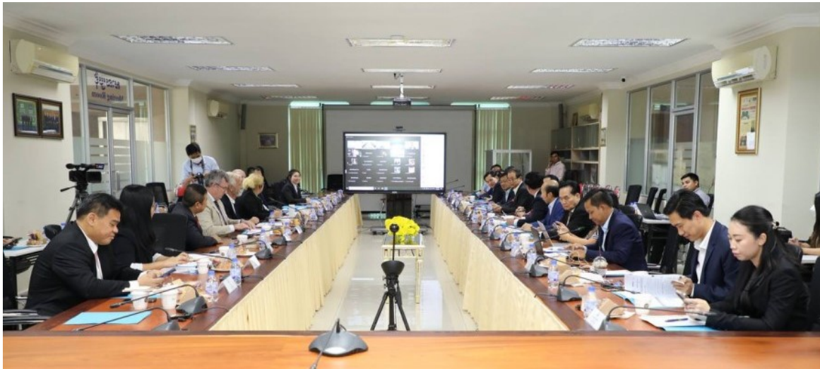
Discussion session among all participants from government, private and development organization/institution

On 3 November 2022, ARISE Plus Cambodia and the Cambodia Chamber of Commerce (CCC) jointly organized a “Round Table Discussion: Process and Future Plan of the Government-Private Sector Forum (G-PSF) and the Provincial Public Private Dialogue (PPPD)”.