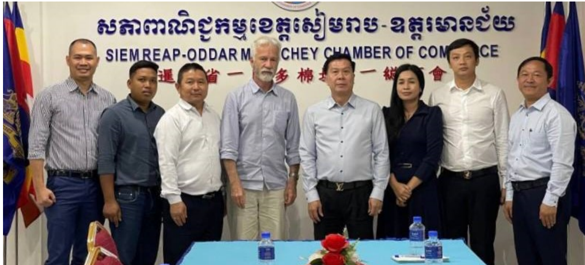
Group photo of the participants during the meeting

On 21 March 2023, ARISE Plus Cambodia organised a visit to the Siem Reap Chamber of Commerce at their office in Siem Reap province. The discussion was held with chamber management, regarding the enhancement of the Provincial Public Private Dialogue (PPPD) through the Government-Private Sector Forum (G-PSF) mechanism.