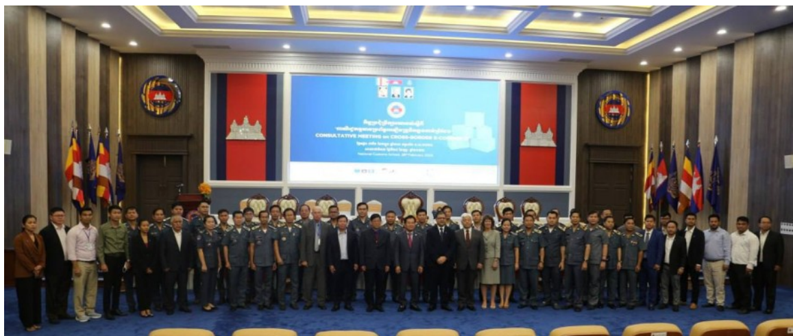
Group photo of all participants during the meeting

We congratulated the GDCE for successfully organizing a consultative meeting with postal and express operators regarding the Draft Prakas on Customs Procedures on Express Consignments and Postal Consignments on 28th February 2023. The meeting took place in the context of the growing trend and importance of cross border e-Commerce, with support from ARISE Plus Cambodia and Swisscontact Cambodia.