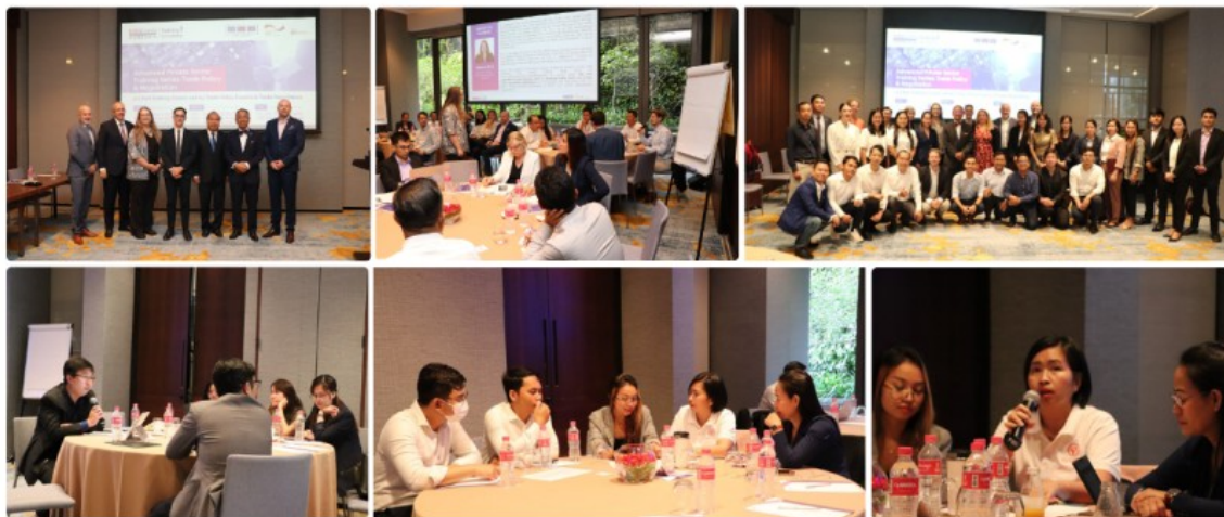
Some photos of various activities during the training sessions

Hosted by ARISE Plus Cambodia and EuroCham Cambodia, the “Advanced Private Sector Training Series on Trade Policy and Negotiations” concluded on 5 April 2023.