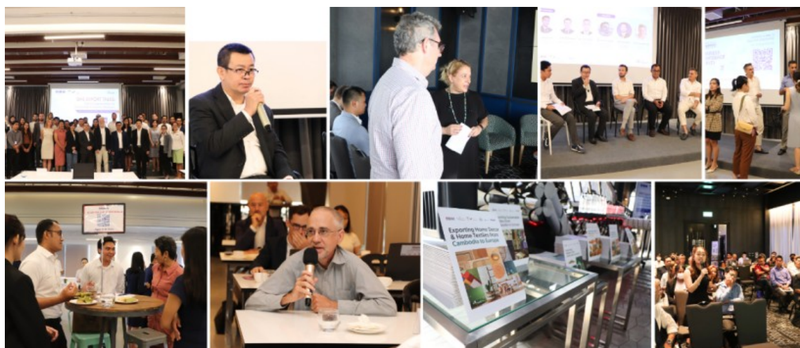
Some activities of the Talks

On 28 February 2023, ARISE Plus Cambodia and EuroCham concluded its ten-event “SME-Export Talk” series, covering the final topic “SME Export of Services: Understanding How Services Can Be Exported”. The event aimed to provide a general understanding of the services export market for Cambodia today.