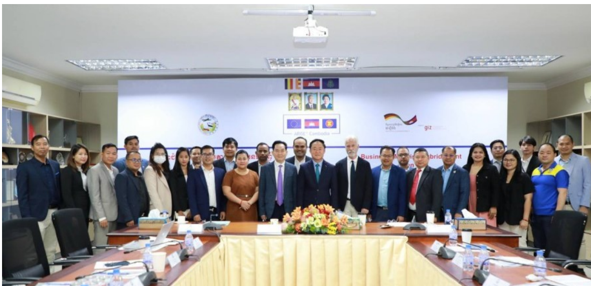
Group photo of participants during the forum