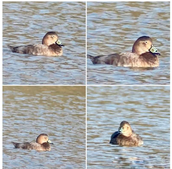
Pochard with nasal saddle fitted

On March 24 th , I noticed a female Pochard fitted with a blue nasal saddle (see image). Personally, I think they look very unsightly but if you can read the unique code, it can provide a rich source of information as to the bird's movement during its lifetime. They are a form of ringing used on waterfowl – much easier to read than a ring fitted to the leg. One of the challenges of reading the code on the nasal saddle is that the quality of these is not great and the clarity of the code can deteriorate over time. Thankfully, this one was OK – a blue nasal saddle with code H9H.