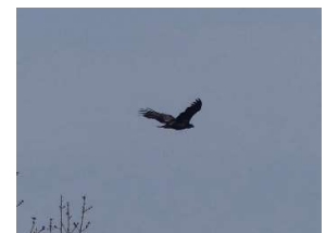
Route of White-tailed Eagle across the country.