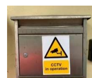
Village Hall post box