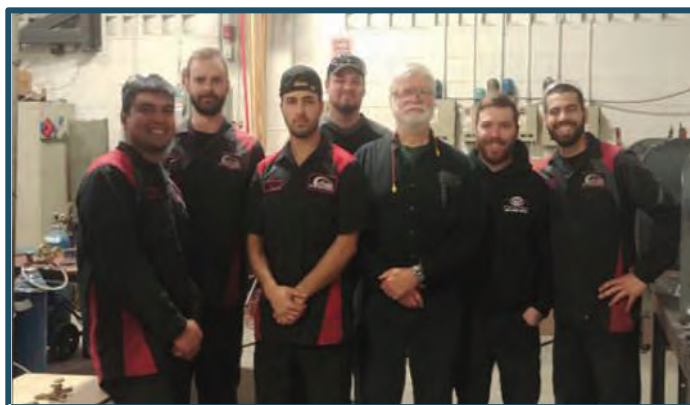
Byma's Tire & Auto staff with TTG Welding Instructors training at St. Michael Catholic Secondary School tech facilities.