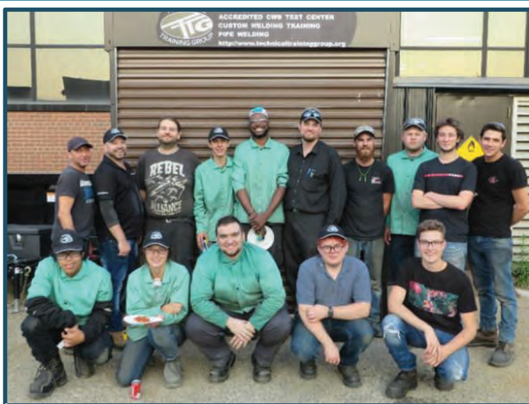
Stratford Manufacturing Pre-Apprenticeship Program

The course was intense but very fulfilling. The high level of commitment necessary to this kind of schedule only ensures that this program will help people develop the much sought-after skills that the industry requires.