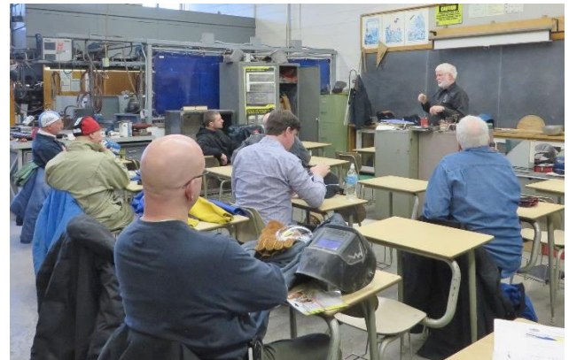
A great response to the Agri-Welding 101 course delivered Apr 2015. The course was designed specifically for farmers, employees in the agriculture sector and hobbyists to learn more about welding techniques and applications and gain the skills necessary to make general repairs and fabricate equipment.