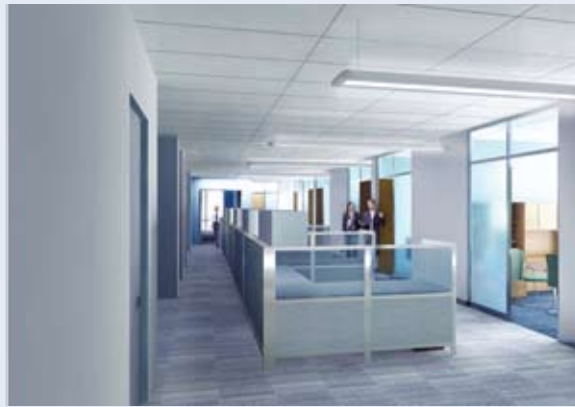
On the left is a view of a typical laboratory; on the right a view of the workstations that 'float' in the middle of the main corridor on each floor.

The general paint palette for the building includes a majority of white and grey paints with punches of blue, red, and lime green. Doors will be painted to match the adjacent wall. Lab doors will be painted grey. The accent wall paint in the offices will be one of three different hues of blue so that from the exterior of the building a random pattern of different blues will be visible.