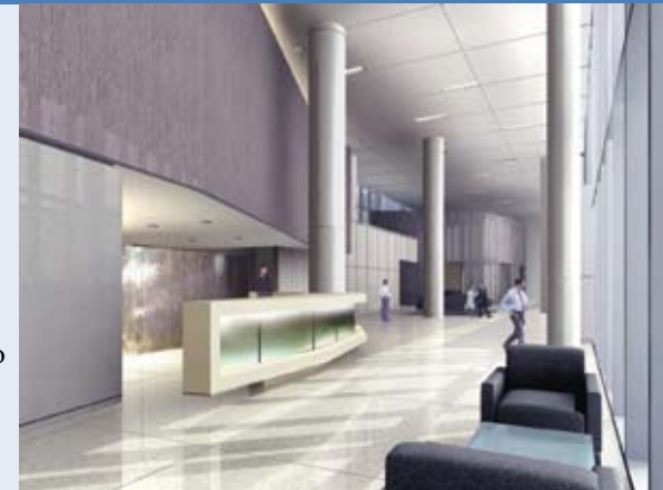
View of the lobby area looking toward the conference center.

Each office will have a “work wall” with storage, files, and a freestanding table with two guest chairs. Medium warm wood for the casework will complement the walnut doors on the office side, with medium grey countertops, and white shelving.