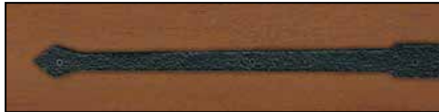
*18" Hinge Strap. Sold Separately Part# PLASHINGESTRP