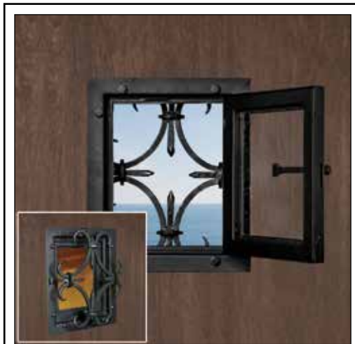
*Speakeasy shown with: Seedy Glass. Part# PLASSPEAKWISB