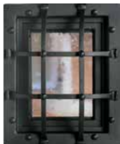
*Speakeasy also comes with square grill design