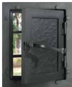
*Speakeasy also available with: Solid Rustic Iron Door