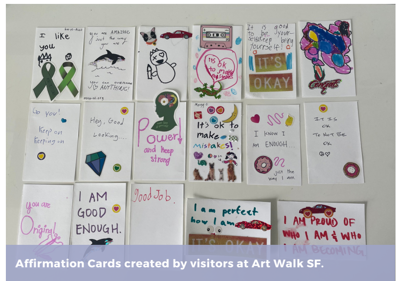
Affirmation Cards created by visitors at Art Walk SF.

Our presence at Art Walk SF was not only an opportunity for us to connect with the local community, but to also shed light on our Holiday Gift Drive. With the holiday season just around the corner, we were gearing up to make a significant impact on the lives of those in need.