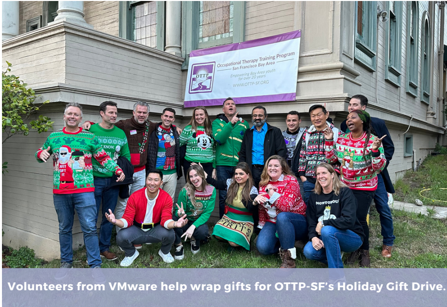
Volunteers from VMware help wrap gifts for OTTP-SF's Holiday Gift Drive.