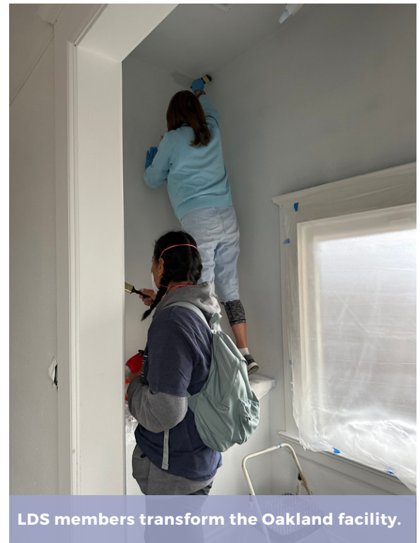
LDS members transform the Oakland facility.

The investment of time and skills by LDS volunteers is not merely a contribution to the aesthetics of the facility, but also to the creation of a warm and comforting atmosphere for future OTTP-SF clients who will receive mental health services at this location.