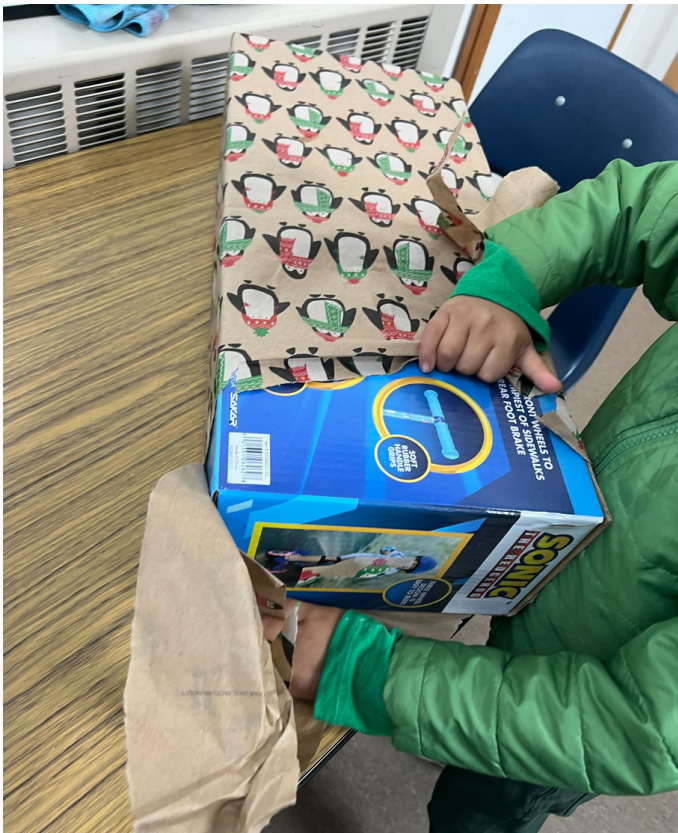
A youth opening up a Sonic scooter.