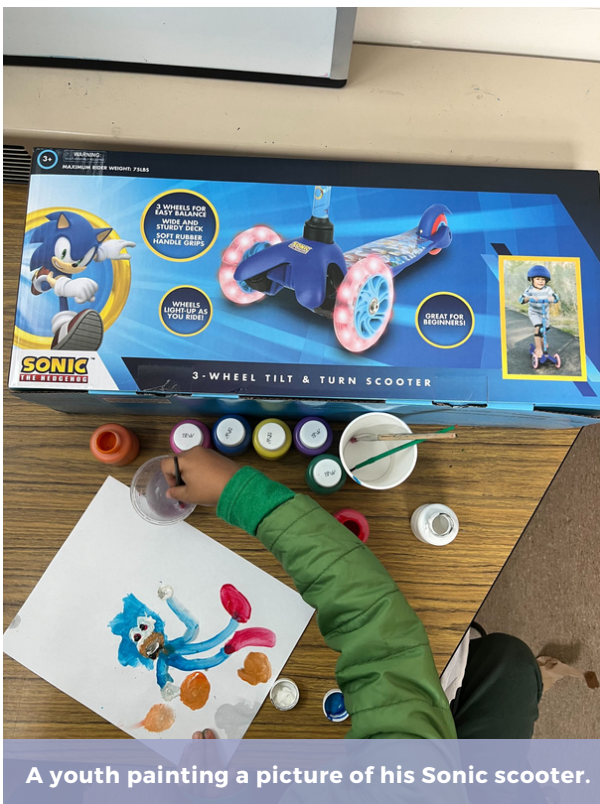
A youth painting a picture of his Sonic scooter.