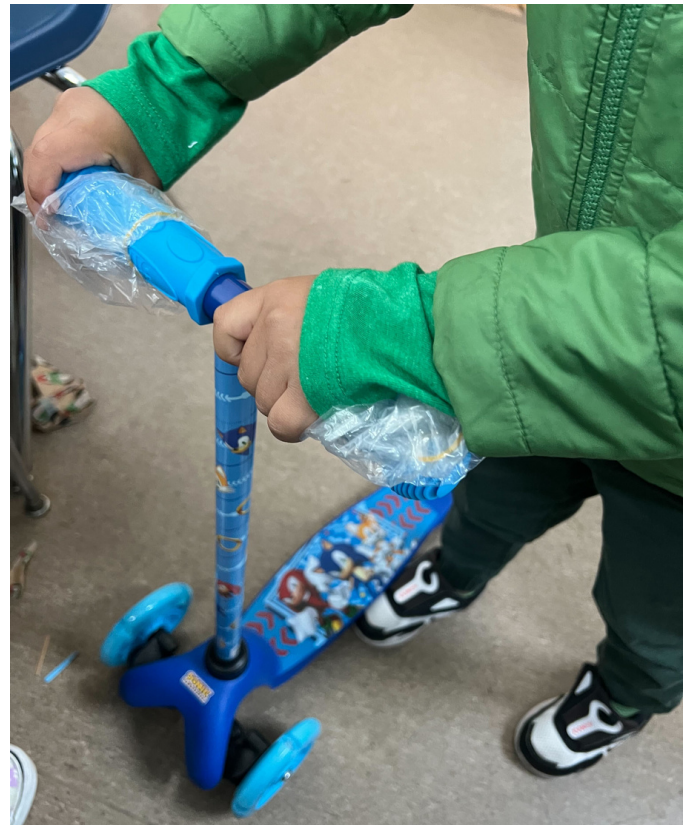
A youth playing with his Sonic scooter.