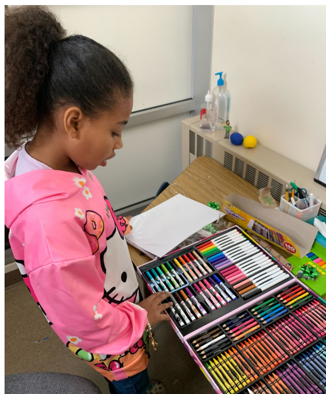
A youth shows her excitement to use her drawing kit to draw pictures during break.