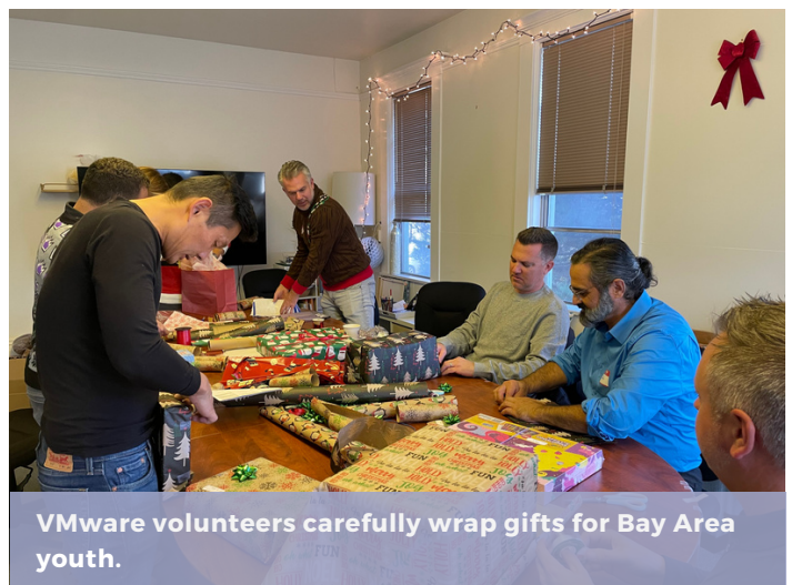
VMware volunteers carefully wrap gifts for Bay Area youth.

Their dedication exemplifies the power of collaboration in spreading holiday cheer and making a meaningful difference in the lives of others. OTTP-SF is looking forward to working with VMware again in the future. Thank you, VMware!