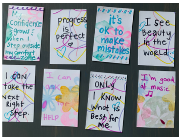
DIY Affirmation Trading Cards.