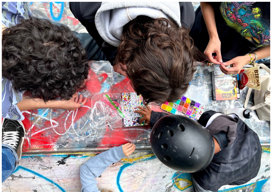
Youth making bracelets at the skatepark.