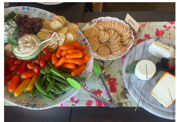
Delicious food provided by Hollie's Homegrown.