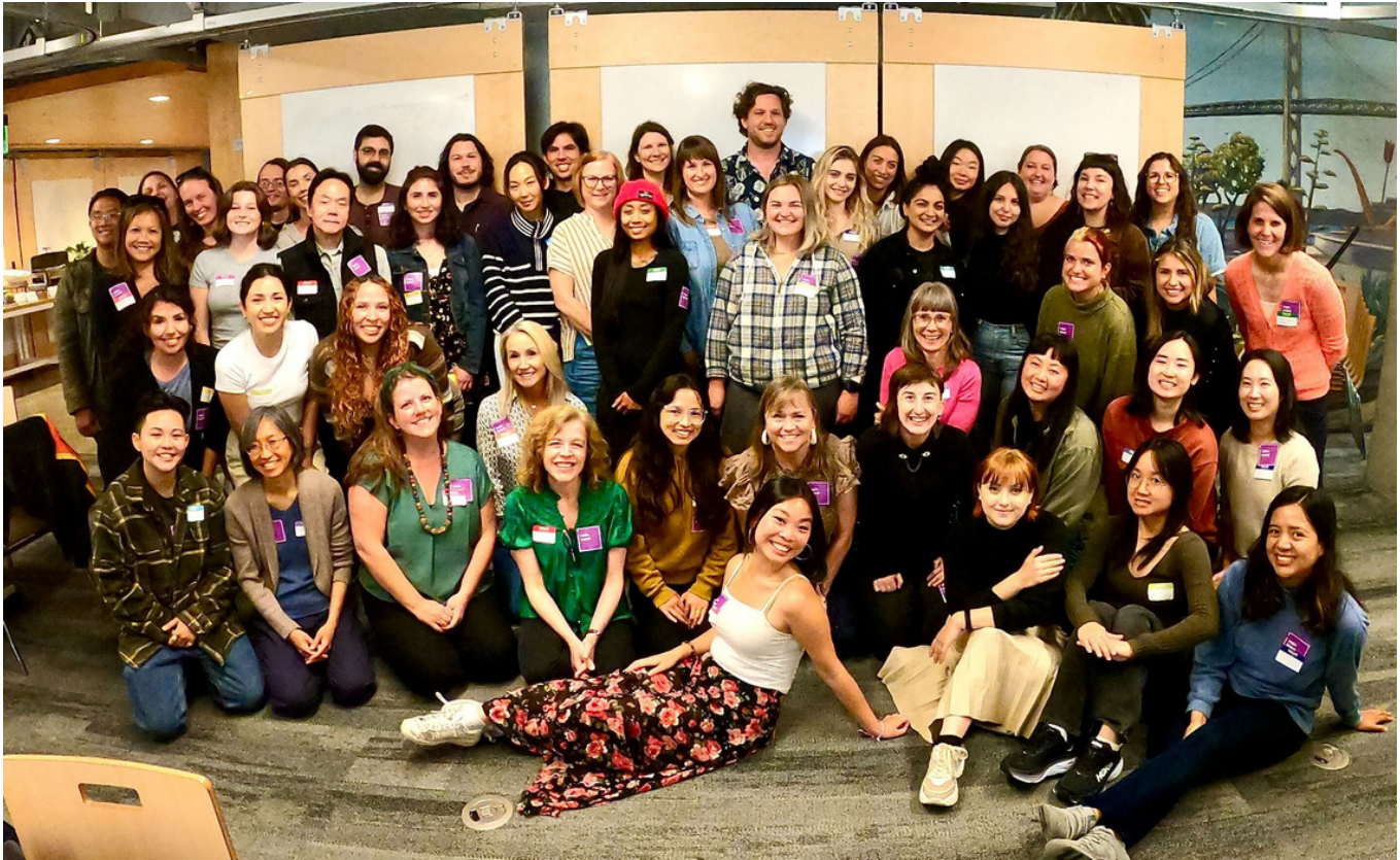
The OTPP-SF team gathered together at the Google Corporate Office to set goals and discuss strategy for a 1 year, 3 year, and 5 year plan for each program.