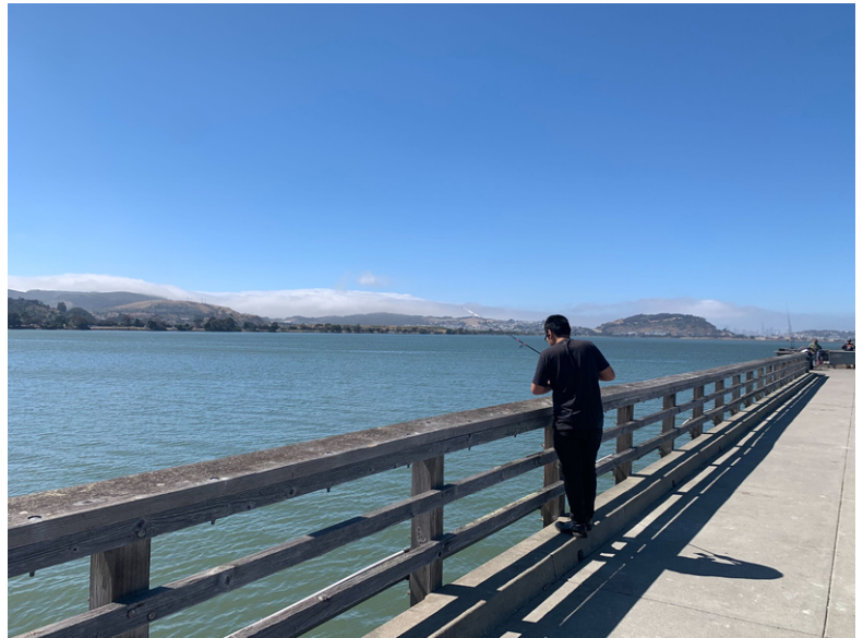
OTTP-SF client fishing at Brisbane Fishing Pier.

One of the most heartwarming developments has been the client's newfound willingness to seek assistance when confronted with tangles or unforeseen obstacles during their fishing expeditions. The transformation is evident as they not only vocalize their need for help but also exhibit commendable self-reliance, successfully tackling these challenges independently.