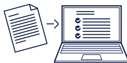
Adaptive Dental Form Extraction