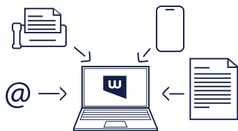
Omni-Channel Document Intake

Processing dental claims involves knowledge workers familiar with the enrollment of new claimants and the activities around entering information about a claim being processed.