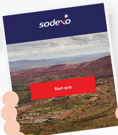
Pre Application Quiz