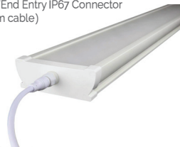
Side/End Entry IP67 Connector (30cm cable)