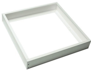
Surface Mount Kit