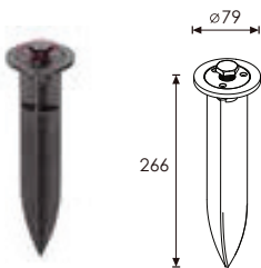
Optional: Plastic Spike (EST-B3P-SPIKE)