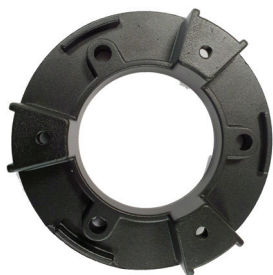
Base frame * Installation instructions included