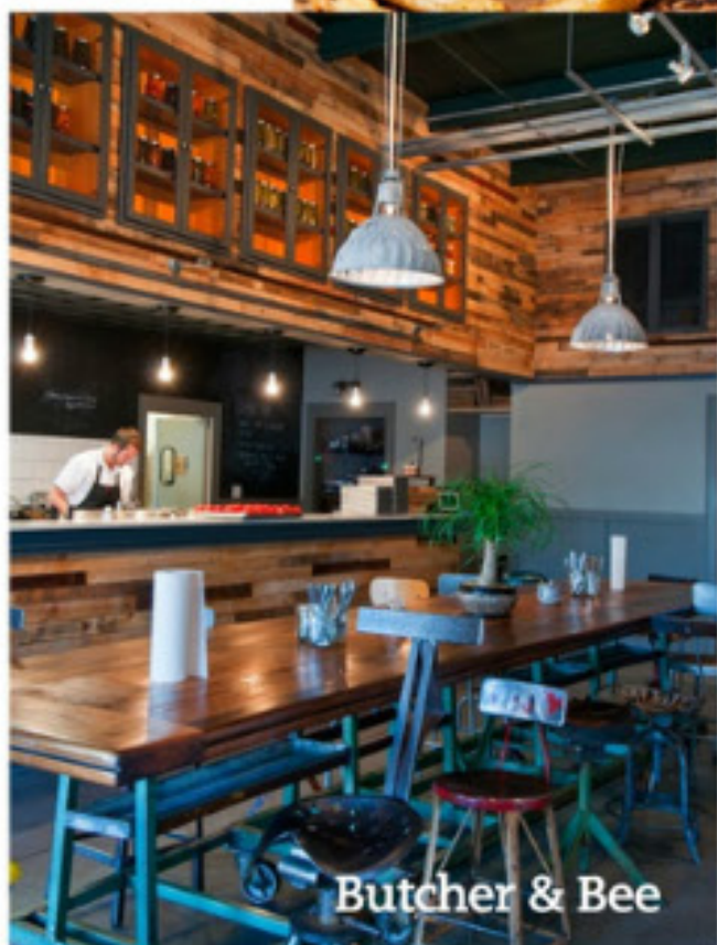
Butcher & Bee