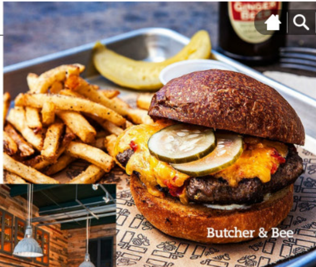
Butcher & Bee