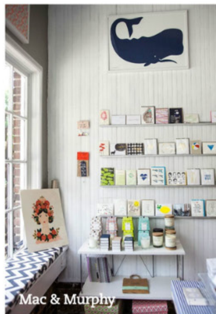
Mac &amp; Murphy