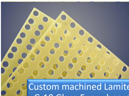
Custom machined Lamitex G-10 Glass-Epoxy board