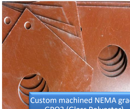
Custom machined NEMA grade GPO3 (Glass Polyester)