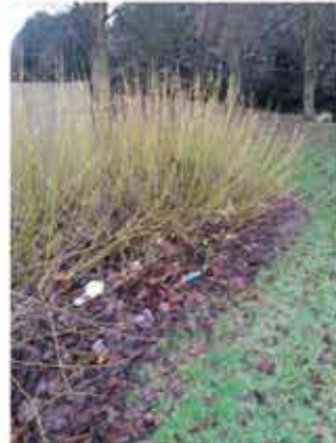
Year 2 Growth